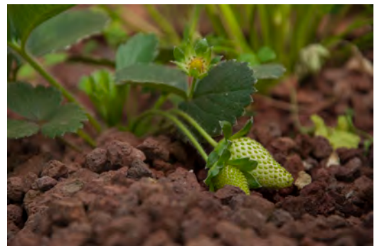
Fig 2.7 Media Bed Filled With Volcanic Tuff

a. Surface Area: Bacteria colonies will thrive on material with a high surface area such as inert grow media (gravel, volcanic tuff, expanded clay, bio balls etc) and they will also grow on plant roots, along fish tank walls and inside each grow pipe. Therefore all aquaponic units have some sort of bio-filtration component where material with a high surface area is contained (either bio-filter media or the actual plant roots). Chapter 4 explains the various types of bio-filter media, but for now it is sufficient to say that all aquaponic units are essentially made up of three physical components: fish tanks to house the fish, hydroponic containers to grow the vegetables and filtration (solids removal and biofiltration) to capture solid waste and house the nitrifying bacteria.