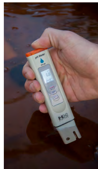
Fig 2.8 P.h & Temperature Digital Deter

C) Water Temperature: This is another very important parameter for the bacteria and for aquaponics in general. The ideal temperatures for bacteria growth and productivity are between 17-34 ° Celsius. Once the water temperature drops below this range (below 17°C) bacteria productivity begins to decrease. Below 10°C, productivity can be as low as 50% or lower. This will obviously have major impacts on unit management during the winter seasons which will be discussed in Chapter 8.