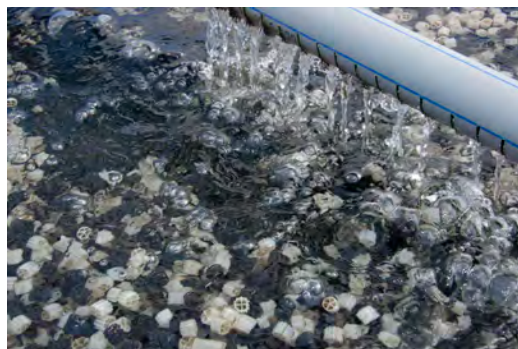
Fig 2.9 Aerated Bio Filter Containing Bio Balls

D) Dissolved Oxygen: Nitrifying bacteria need good levels of Dissolved Oxygen (DO) in the water at all times in order to grow healthily and maintain high levels of productivity. Optimum levels of DO are between 4-8 milligrams per liter (mg/L). Nitrification will struggle if DO concentrations drop below 2.0 mg/l.