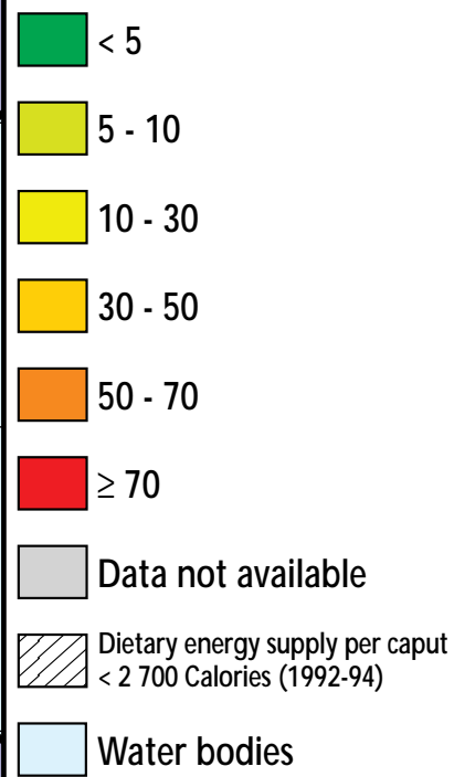
Average 1988-90 food import dependency (%)