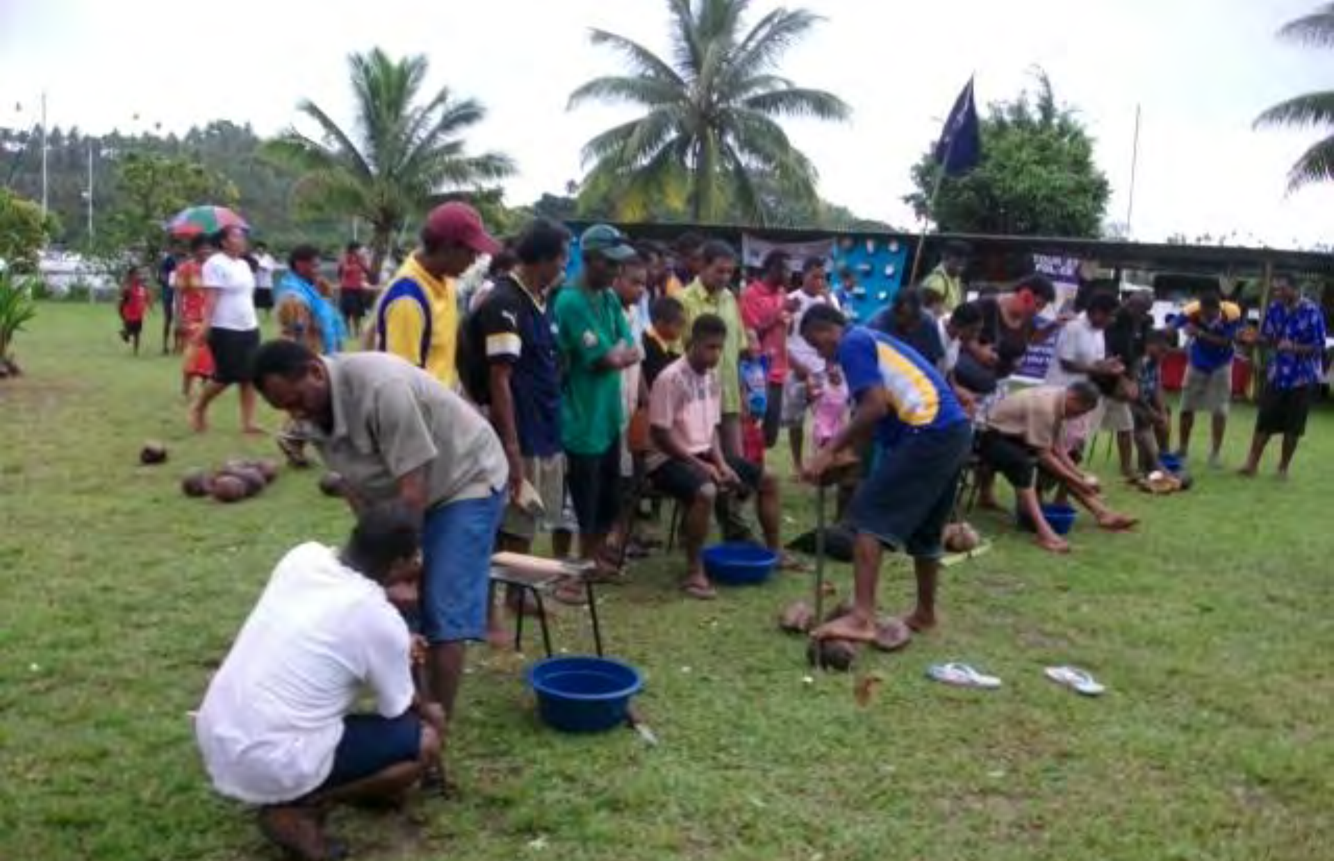
COCONUT DAY CELEBRATION