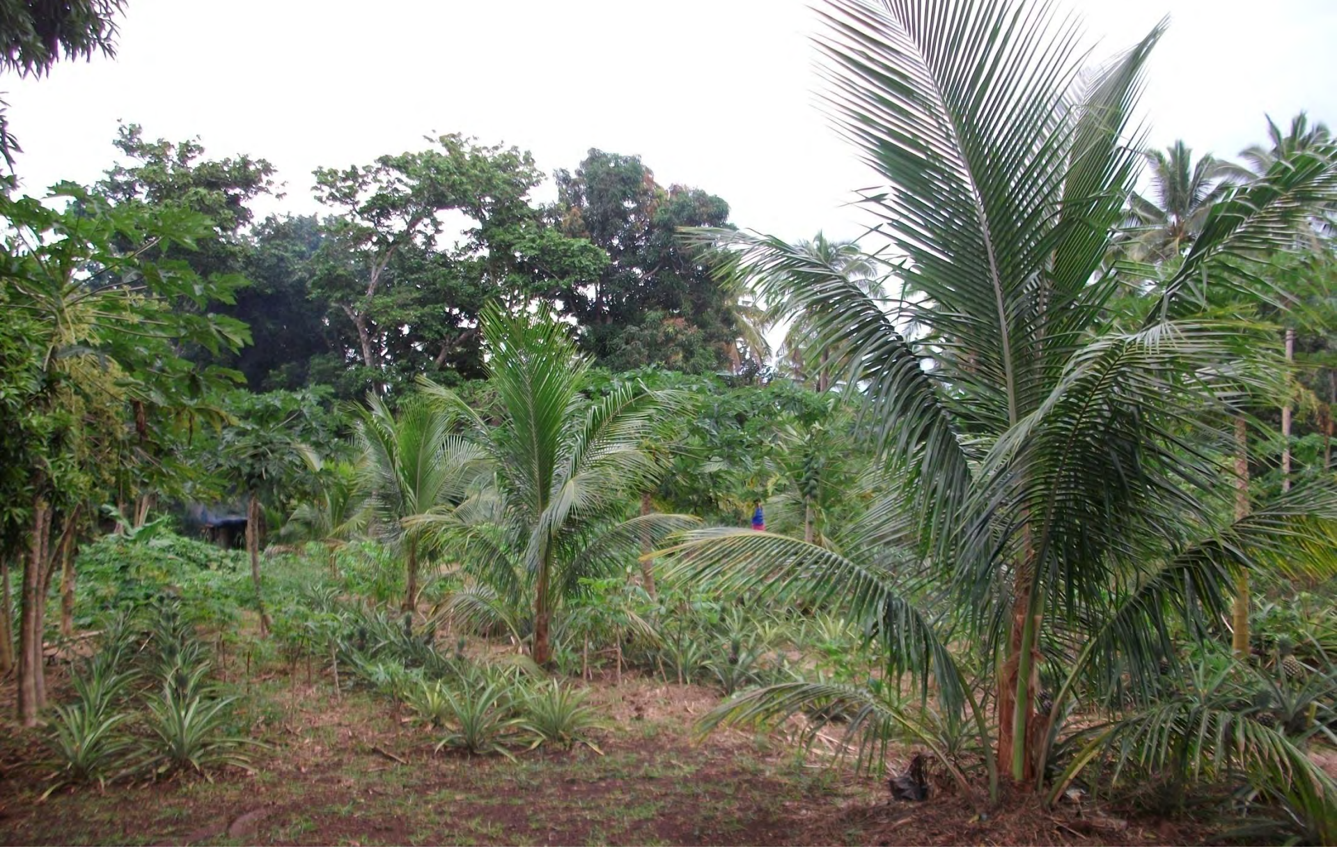
Coconut Based Farming System