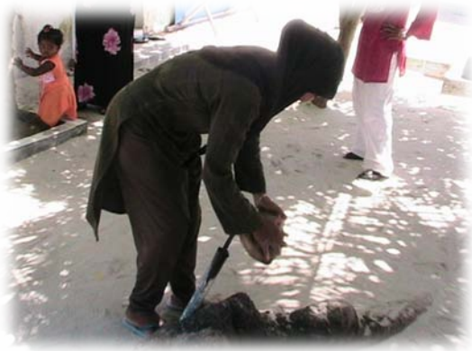
Dehusking of coconuts using a traditional dehusking tool