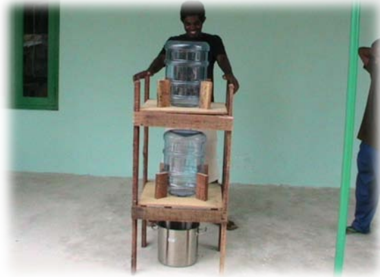
VCO Filter set-up