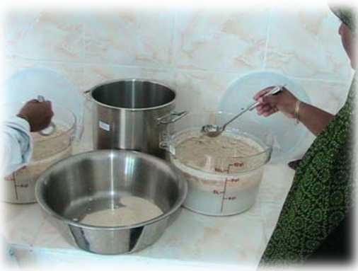
Harvesting of oil after fermentation