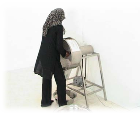
Grating of coconut meat