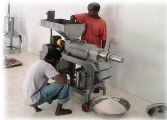
Milk extraction machine