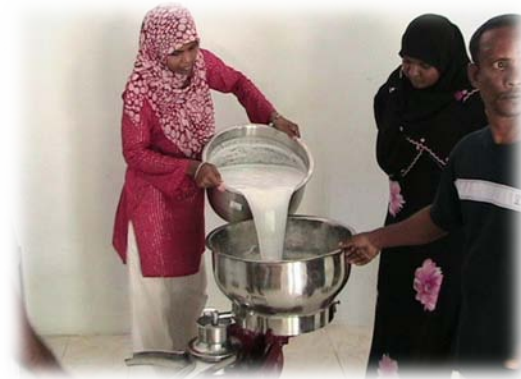
Pouring the milk into the cream separator feed bowl