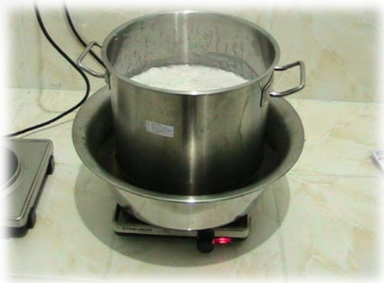
Preliminary heating of coconut oil/cream