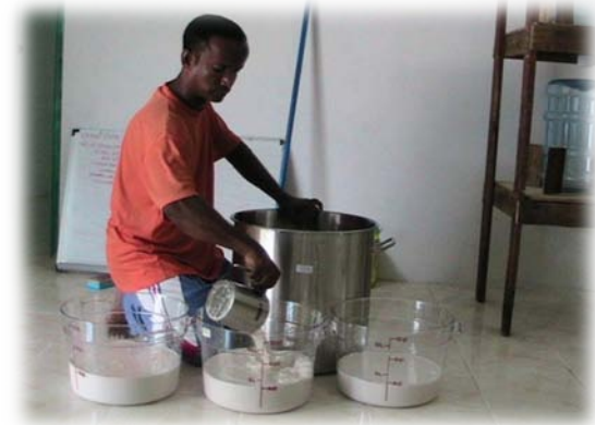
Pouring the coconut milk into fermentation containers