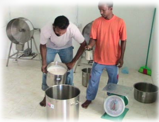
Mixing coconut milk and water