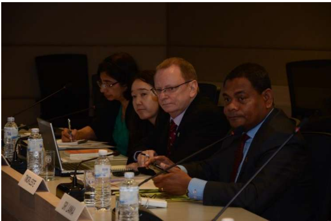
FAO professional staff and the government representative from Timor-Leste