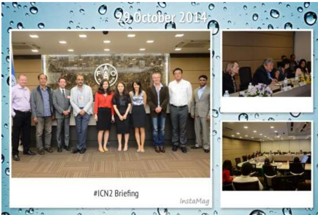
Group photo for a FAO RAP Photo Story (Web)