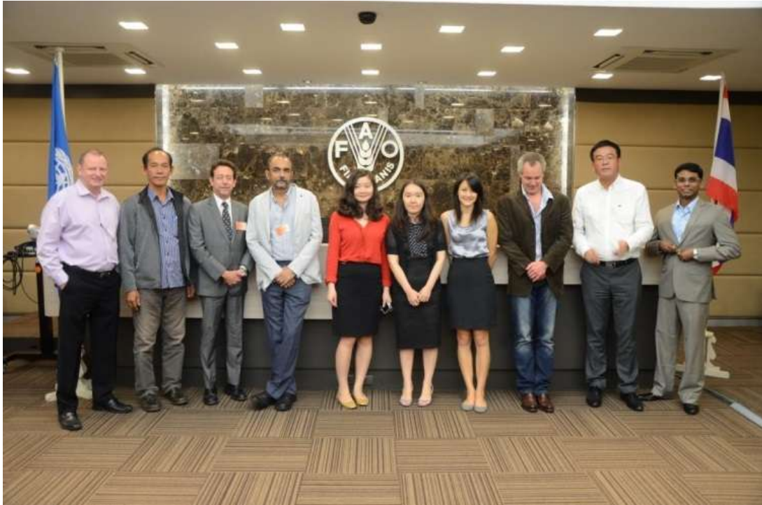
International correspondents and journalists flanked left and right by two FAO Communication and Knowledge Management Officers