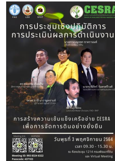
Ministry of Agriculture – FAO RAF