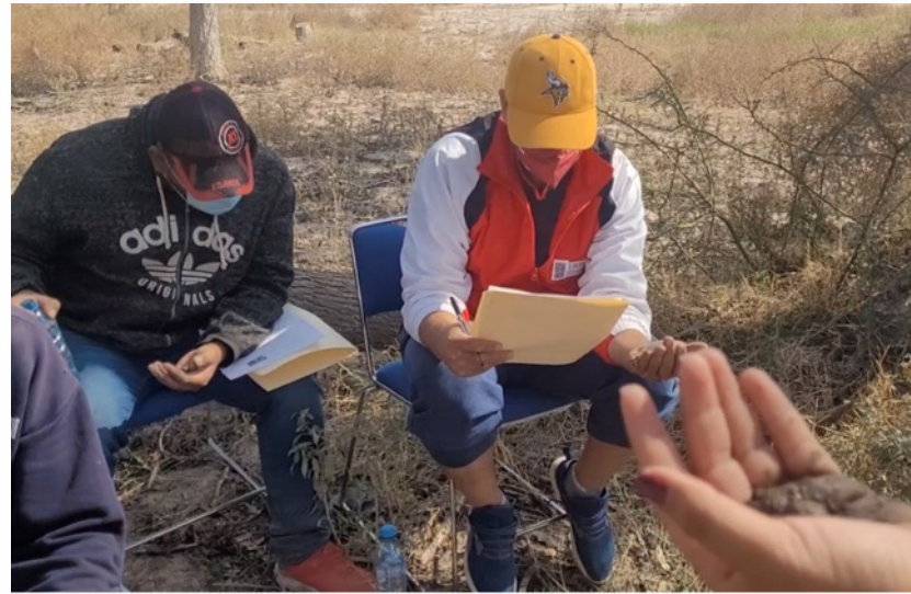
Practical exercise on soil texture