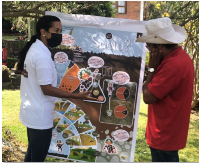
Soil Doctor trainer showing the poster on What is soil?