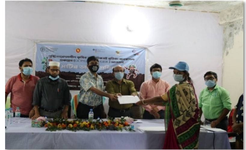
Soil Doctor Certificate distribution