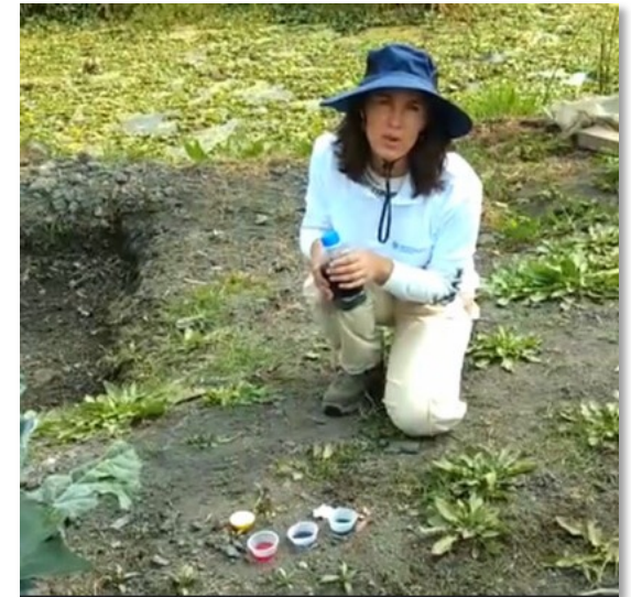
Practical exercise on soil pH determination