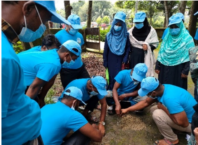
Practical class on soil pH determination