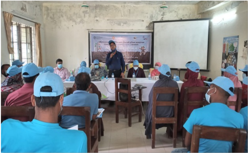
Soil Doctor trainer briefing about Soil Doctor