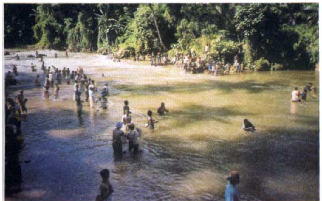
Indonesia : The BOBP2 assisted pilot activity in Taipan Nauli Bay provided lessons in participatory fisheries management.