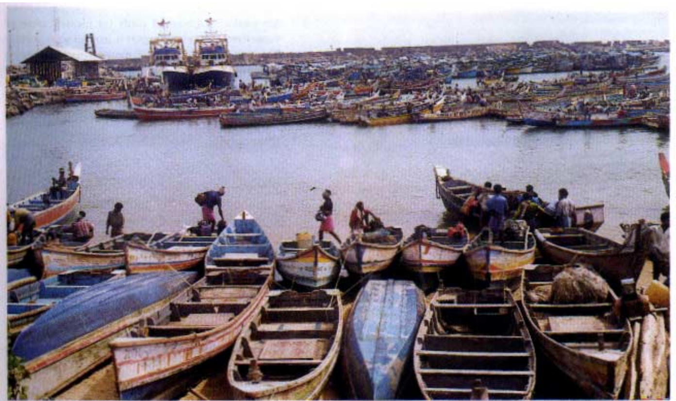
India: Fishing fleet at Chinnamuttom, Tamil Nadu, gives an idea of the pressure on resources.