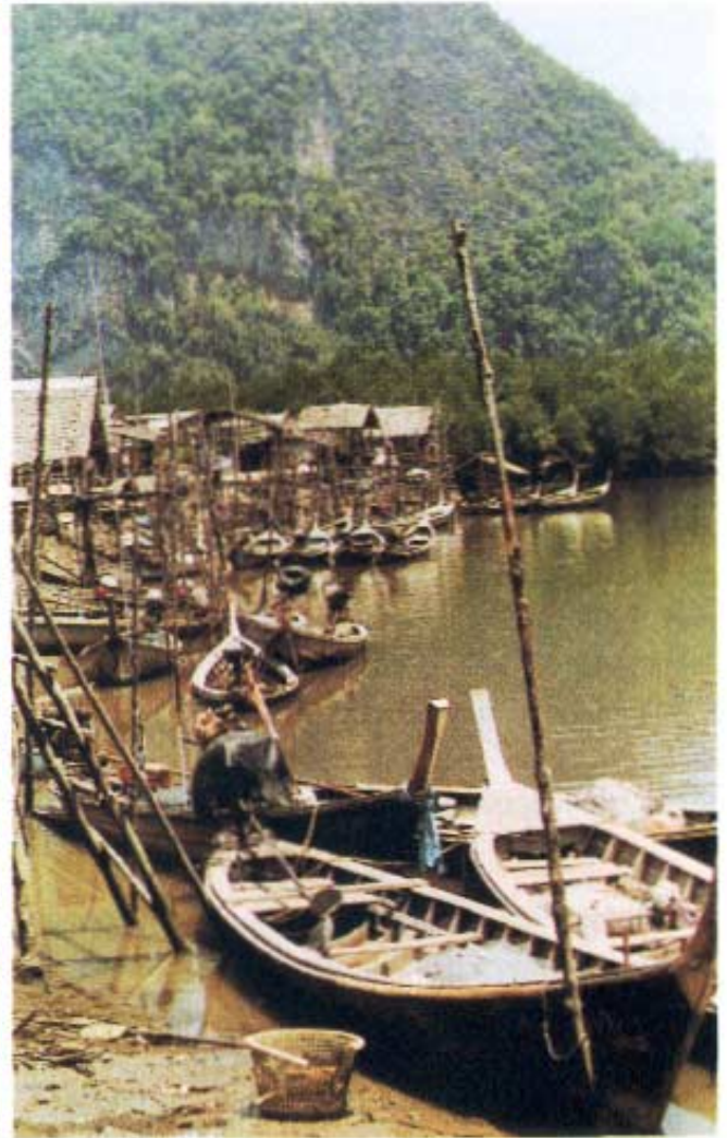
Thailand: Community-based fisheries management (CBFM) was successfully demonstrated in villages of Phang-Nga Bay.