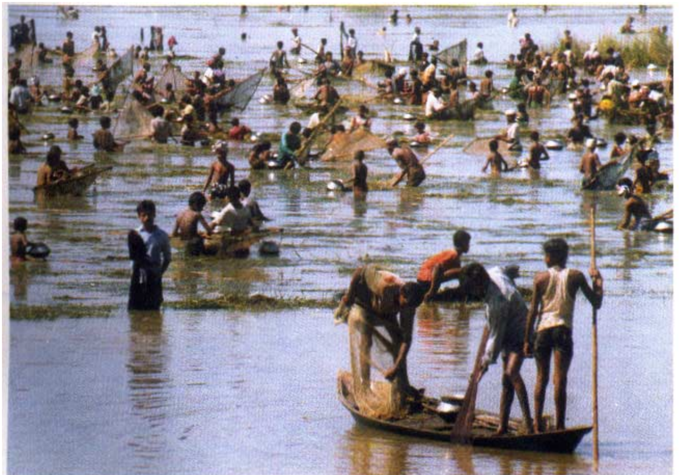
Bangladesh: Fisherfolk who depend on the resource-damaging setnet and push net fisheries need alternative livelihood options.