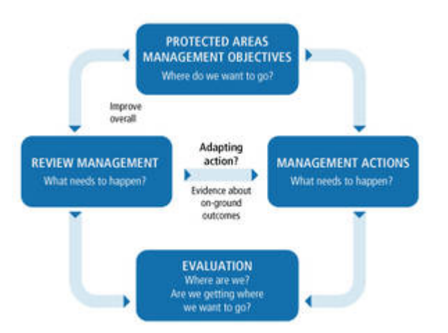
Figure 2. Rational, adaptive and participatory managing planning process (Spoelder, P. et al. , 2015)

While each of the six protected-area categories addresses different objectives, all require a proper management planning process. IUCN has developed <u>management guidance</u> for each of the IUCN protected area categories.