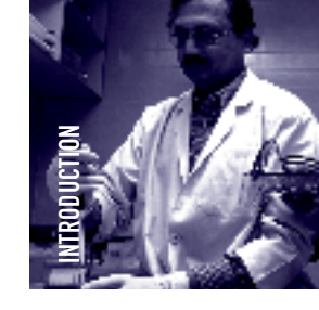
FIGURE 2 // FAO BIOSAFETY ACTIVITIES UP TO 2009