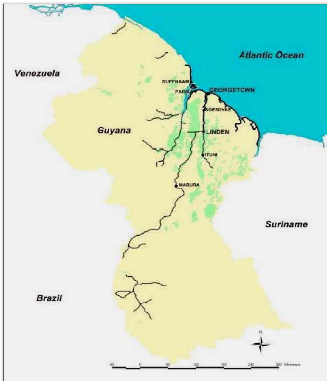
Figure 3. Map of Guyana showing main roads (thicker line denotes metalled surface), Wallaba and Dakama forest (green) and key settlements.