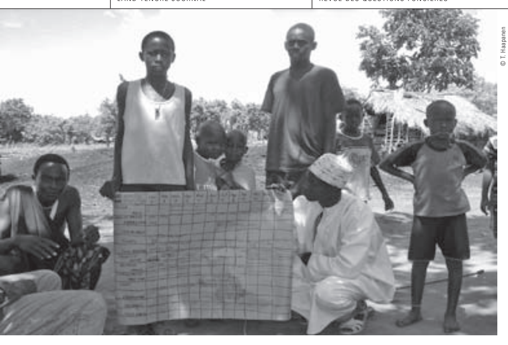
Picture 1 Paraquyu—Maasais and their seasonal calendar in Mindu-Tulieni. They are pastoralist—farmers. The village was established in1975 during the Ujamaa period.