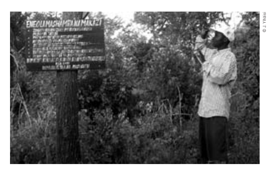
Picture 2 A sign indicating the farming and housing area according to VLUP by-laws in Masuguru village, which is now divided into two villages. People in the new Mwetemo village are not aware that they may need a new VLUP, because the water source on their side is still being used by people from old Masuguru. Both villages are still waiting for their land certificates.

There are too few people qualified in the VLUP process, and the work would take years even if the money for it were available; now, after the demarcation of the village boundaries, the limiting factor has been money. In Bagamoyo, there is only a draft VDLUP. In January 2010, the plan was almost ready when the laptop computer containing it was stolen. There are already 19 villages with a VLUP. In practice, the few completed VLUPs are in villages where there have been serious conflicts between pastoralists and farmers. The 13 villages under the Wamimbiki wildlife conservation project (Box 3) are those where the investor has paid for the work, and has an option to lease the land after the VLUP is finalised; this is the way investors are also acquiring land in Mozambique (Wit et al., 2009).