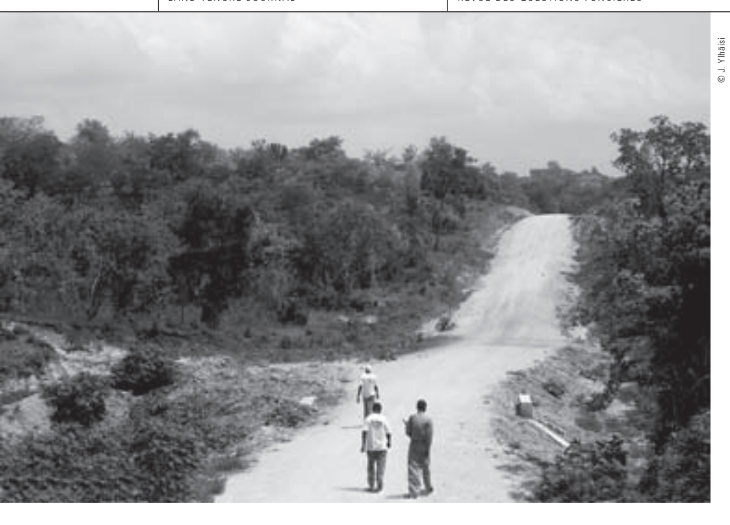
Picture 3 A village forest reserve demarcated on the left side of the road by the VLUP, on the way to the village centre of Msoga. The present bushland is recovering as a result of protective measures, including moving Maasai houses and cattle to a more remote area near the eastern boundary of the village.

away. According to the village chairman (Meeting, December 2008) the only negative aspect following the process has been an increase in quarrels about boundaries between neighbours in the village. (Manara (2008) Similar reports haves been heard in insimilar reports, in the neighbouring Handeni district.) Pastoralists are still entering the existing farming areas proposed for irrigation (Interview, February 2010).