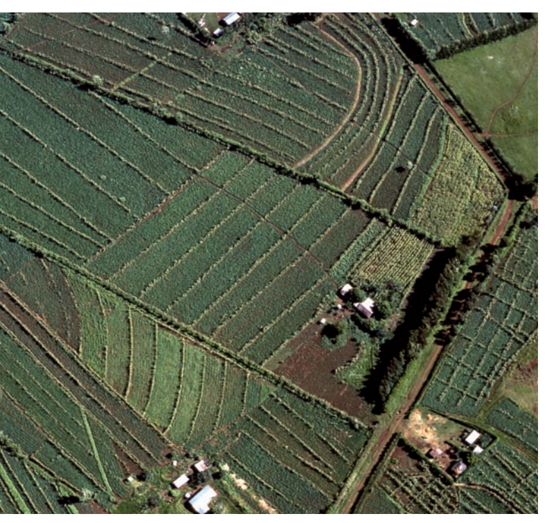
Integrated land use system with maize-bean intercropping and grass strips for fodder production in a high potential area (Hanspeter Liniger).

bunds, vegetative or structural barriers / traps. All these are part of an integrated soil fertility management leading to an improvement in soil organic matter and soil structure. Improved agronomy is an essential supplement to good SLM practices. Strategic choice of planting materials that are adapted to drought, pests, diseases, salinity and other constraints, together with effective management is a further opportunity.