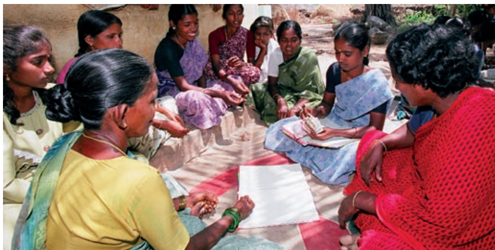
Agricultural cooperative in India

and non-farm enterprises, and to obtain skilled jobs and jobs in non-traditional agricultural export (NTAE) industries, that are better paid than traditional agricultural ones.