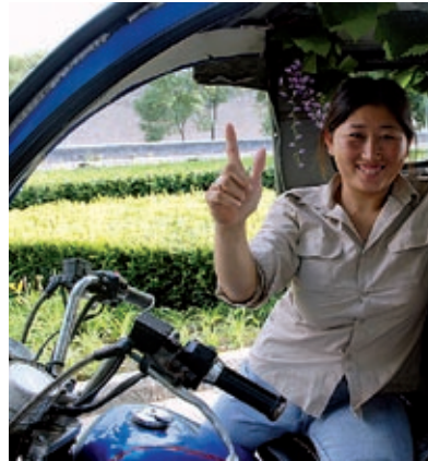
Equipment operator in China

joint titling of land/assets, and revising discriminatory inheritance laws.