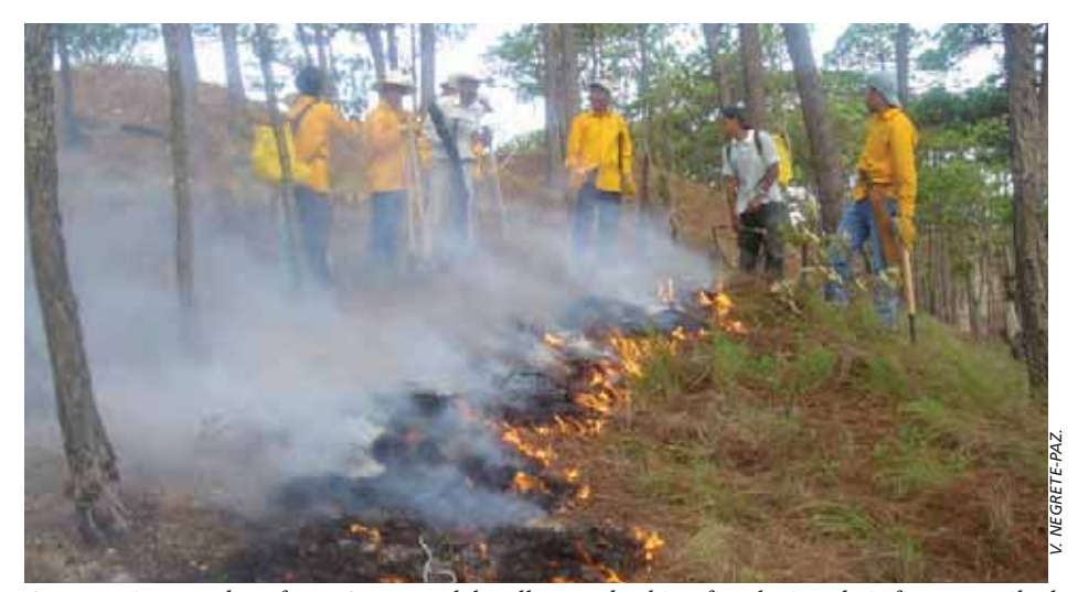
Community members from Corazón del Valle set a backing fire during their first prescribed burn

In May 2006, the communities completed their first planned prescribed burns (Photo). The burns were conducted by the ejido members. They were assisted by personnel from CONANP, CONAFOR and the municipality of Cintalapa. The objectives of the burns were to: reduce hazardous fuels, remove vegetation to favor pine regeneration, improve the forage quality of grasses and train younger