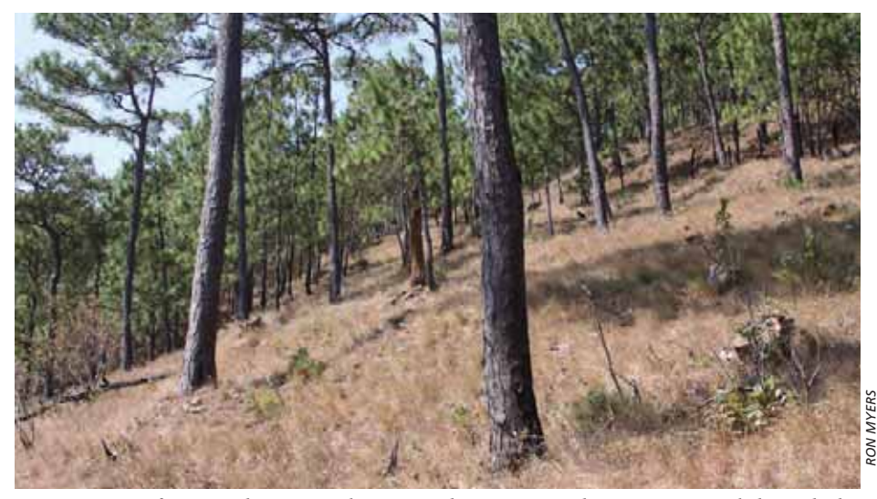
Pinus oocarpa forest in the La Sepultura Biosphere Reserve that is maintained through the use of fire

The pine forests in the region are dominated by Pinus oocarpa (known locally as ocote ), the most widely distributed pine in Mesoamerica, ranging from central Mexico to northern Nicaragua (Photo). The pines are highly fire-adapted. Larger trees have thick protective bark and high, open canopies that allow for the dissipation of heat. Seedlings require bare mineral soil and direct sunlight: conditions that are created by fire. Saplings have the ability to resprout from the root collar if the main stem is top-killed by fire, providing an "advance regeneration" that can respond rapidly to fire-free periods. The pine forest frequently has a subcanopy of scattered fire-tolerant oaks ( Quercus ) and a diverse, flammable ground cover dominated by bunch grasses. The fire regime