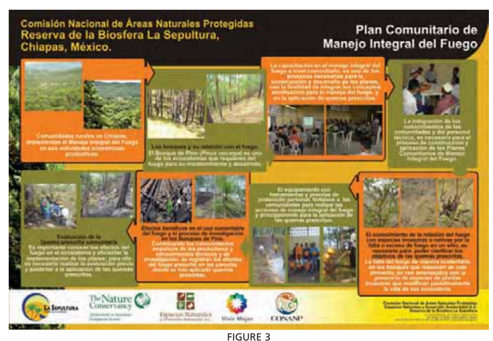
Poster produced by the La Sepultura Project to promote CBFiM

4. appropriate agencies are obligated to develop capacity in fire use.