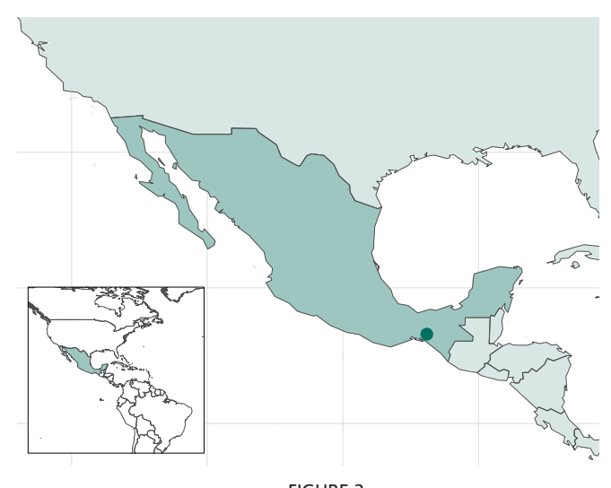
FIGURE 2 Location of La Sepultura Biosphere Reserve

The case study presented here involves two ejidos (communal lands managed by rural villages) that are within the buffer zone of the La Sepultura Biosphere Reserve, Chiapas, Mexico (Figure 2). La Sepultura Biosphere Reserve is one of the most diverse forest reserves in Mexico and the world. It covers 162 700