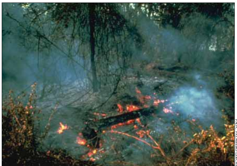
Satellite data can be analysed to estimate emissions from burning of biomass

Two other methodologies to assess individual crown areas from aerial photographs are the valley-following method (Leckie et al. , 2003; 2004; Gougeon and Leckie, 2006), which involves following valleys of shade in a grey-level image, and the watershed method (Wang, Gong and Biging, 2004; Hirata, Sakai and Tsuboto, 2009), which views the gradient magnitude of an image as a topographic surface and