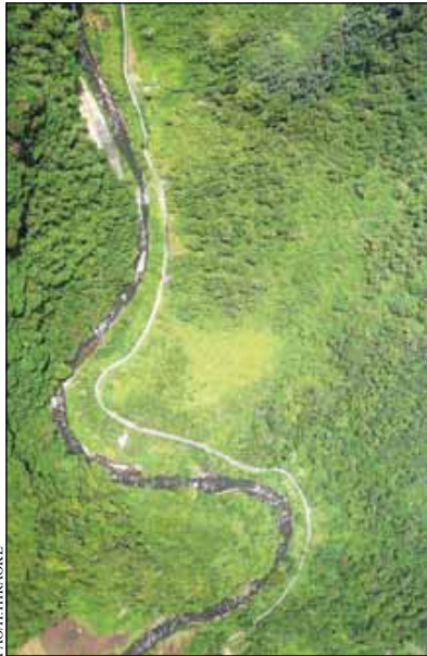
Road, stream and forest area, Indonesia. Aerial photographs can provide information on structural changes of forest canopies over time

creates boundaries, or “watershed lines”, on the basis of the pixels of the greatest magnitude. The latter method can be useful for the identification of degradation at the canopy level.