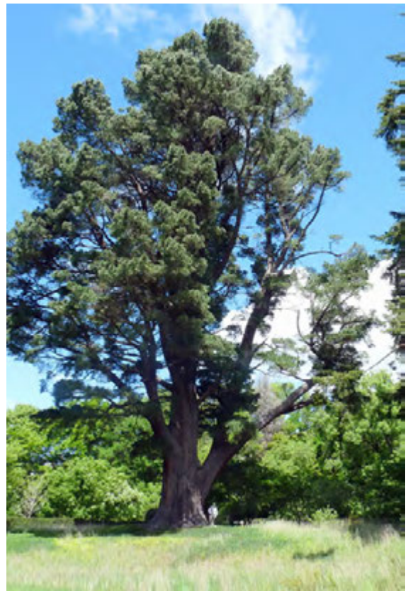
Note: The tree is 3.1 m in diameter and almost 50 m tall; photograph taken in 2010.

to England, from seed collected in 1830. This appears to have been the first planting of radiata pine outside its native habitat.