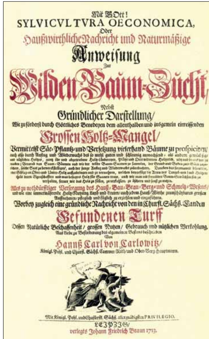
A facsimile of the front cover of the first edition of von Carlowitz's seminal work, Silvicultura oeconomica