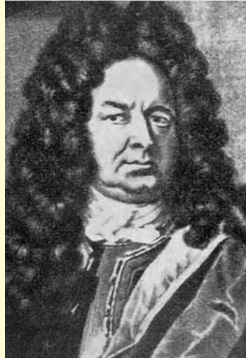
Hans Carl von Carlowitz, 1645–1714