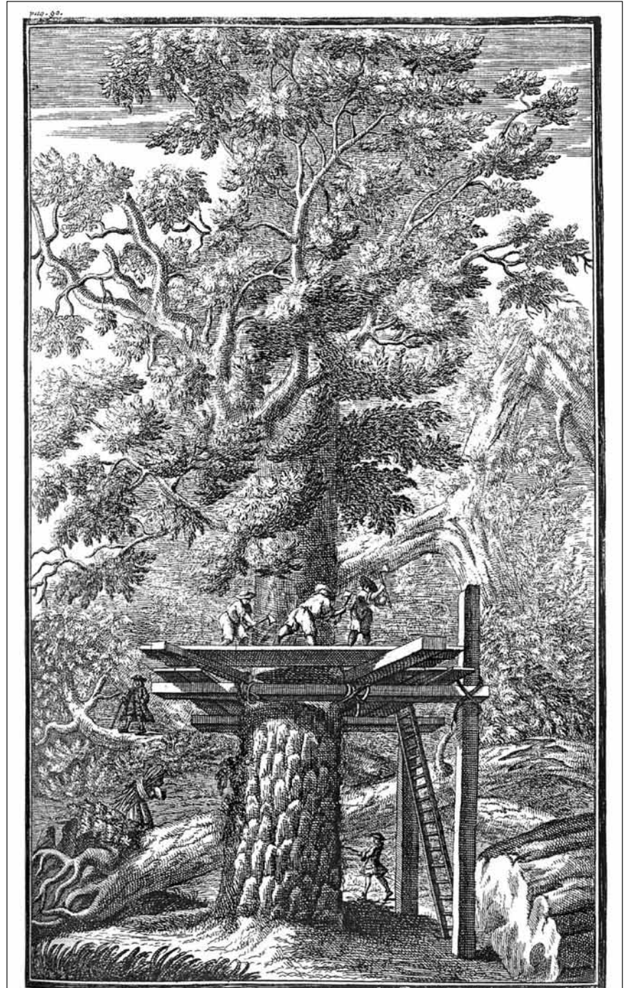
An engraving of woodcutters that appeared in von Carlowitz's Silvicultura oeconomica

In Germany, Austria and Switzerland, the need to supply the mining and salt production industries was urgent. In coastal countries such as Britain, France, Portugal, Spain and Sweden, maintaining a wood supply for shipbuilding was one