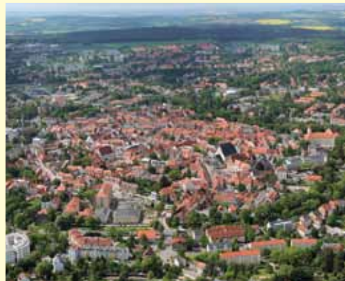
Modern-day Freiberg, Germany

Most important was his forcefully argued and simple message that there would be no future wood supplies if the cut-over areas were not replanted systematically. This implied not just comprehensive legal and economic measures undertaken by the state, but a complete rethinking of the forestry problem and a major effort to persuade people