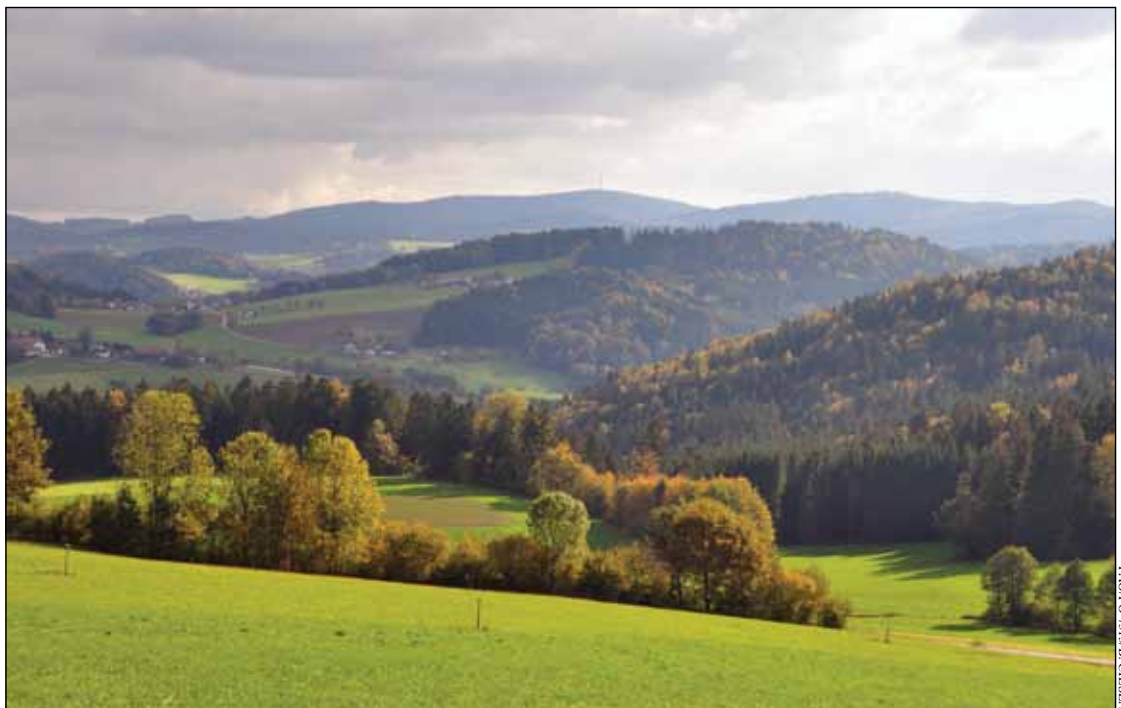
Mixed broadleaf forest, Germany

At the same time, empirical studies show that forests have acquired new meaning and significance in society. The aesthetic values of trees and forests were already acknowledged at the turn of the twentieth century (von Salisch, 1902). For a growing part of the population today, the forest represents a space for recreation that is different from more intensively used areas. Increasingly, Europe's forests are seen as natural; people perceive them as representing the free interplay of natural forces, in contrast with inhabited areas and land exploited intensively for agriculture. This perception reflects the needs and preferences of a growing part of contemporary society and the desire of urban populations for relaxation in natural surroundings. Forests address a need brought on by growing threats to the