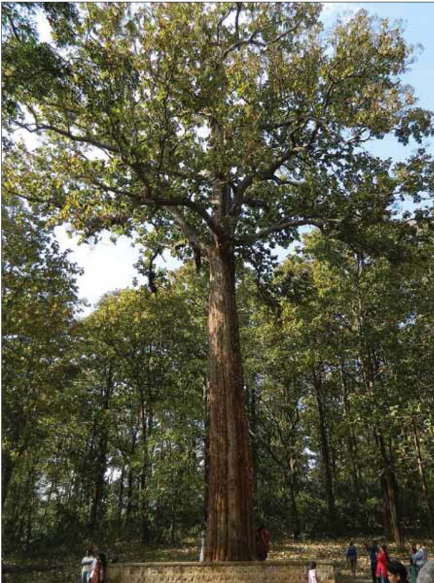
The world's largest teak tree, Parambikulam forest, Kerala, India

Brandis developed teak growth-and-yield tables as a reliable basis for determining allowable annual cutting volumes under a sustainable management regime. Forest protection plans against tree disease and fire were drawn up, timber purchasing rules were formulated, and extensive teak plantation schemes were planned and implemented. The Indian Forest Service, with administrative and operational districts under the responsibility of forest conservators, was established, with Brandis at its head. Brandis also prepared new forest legislation and helped establish forest research and training institutions – in particular, the Imperial Forest Research Institute at Dehra Dun in 1906. Many of the accomplishments of Brandis were of interest in other countries in Asia and Africa and contributed to the spread of sustainable forestry practices.