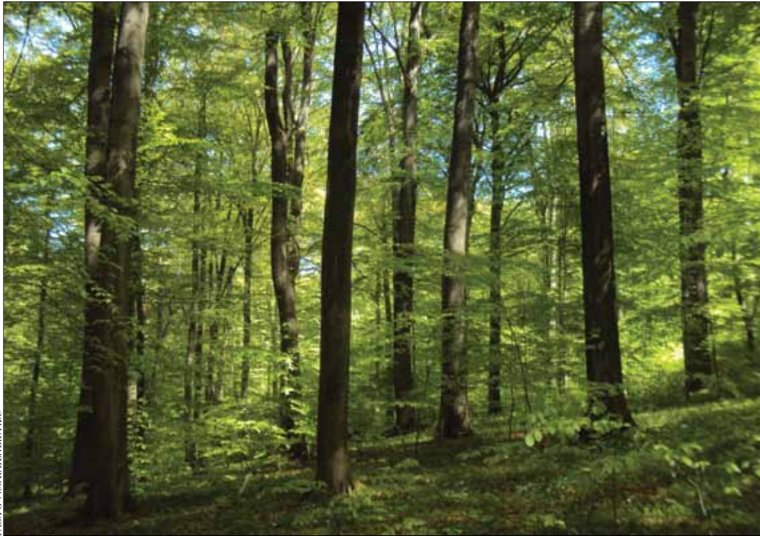
Natural beech forest, Germany

both public and private, who calculated allowable annual wood harvest quantities in relation to the growth and yield of the available forest stands. One of the methods for regulating the rate of wood-harvesting was an area allotment system ( Flächenfachwerk ) that divided forest into annual harvest sections. The volume allotment method ( Massenfachwerk ) was later introduced to account for differing wood-supply capacities, by area. In this latter method, the usable total growing stock was divided according to the planned rotation period. More recent methods include management regulations based on the annual increment of forest stands, and the control method, in which the sustainability adjustment is based on a periodic assessment of the development of the growing stock.