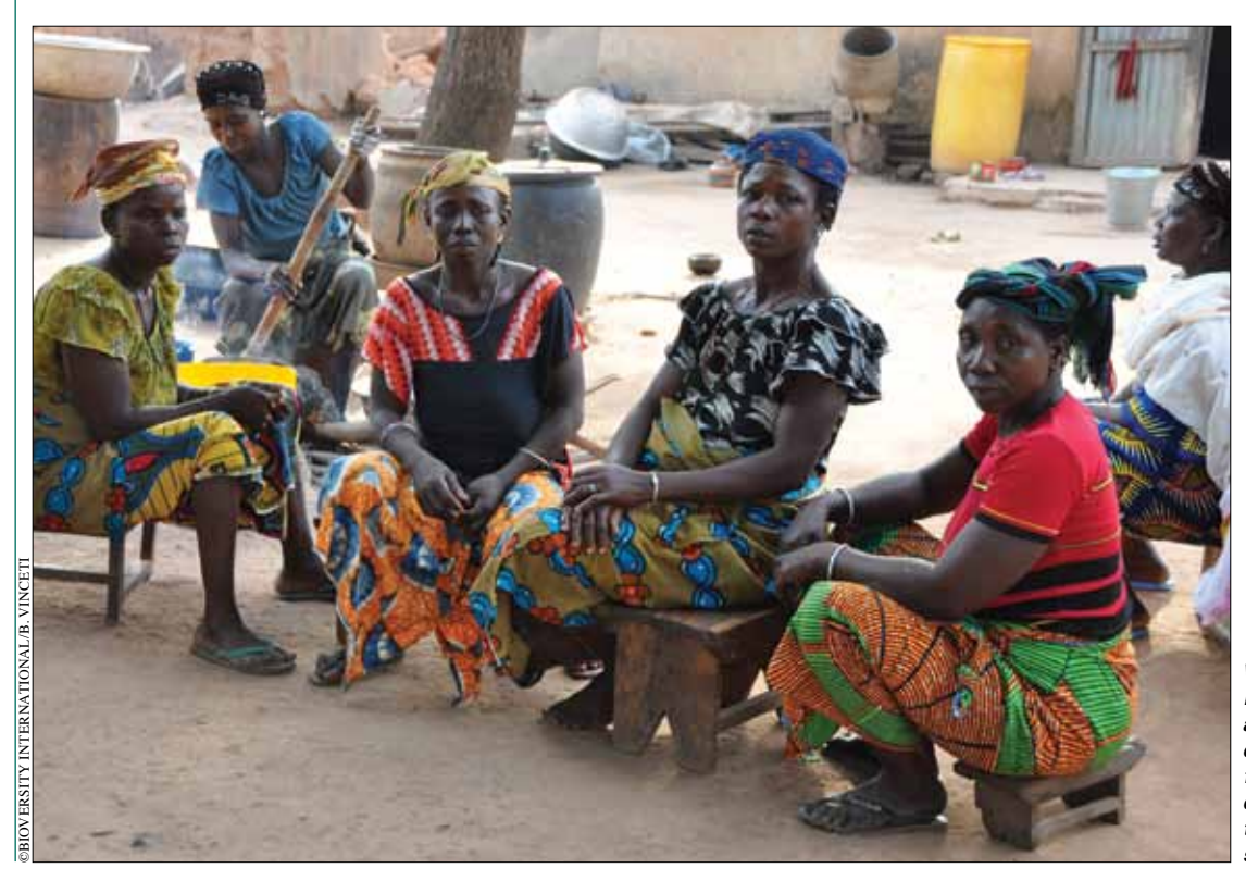
Women in Parakou, Benin, gather for a focus group discussion about the food tree species commonly used in the diet during food shortage periods

Many traditional communities actively manage the wild resources they use. Where there is conflict over the use of multipurpose species that supply both timber and food products, forest management plans should be negotiated with timber companies and adapted to consider the interests of both local communities and timber companies (Ndoye and Tieguhong, 2004). Such an approach should be based on sound cost—benefit analyses that take into account the nutritional and cultural importance of forest foods in the diets of the most vulnerable: women and children.