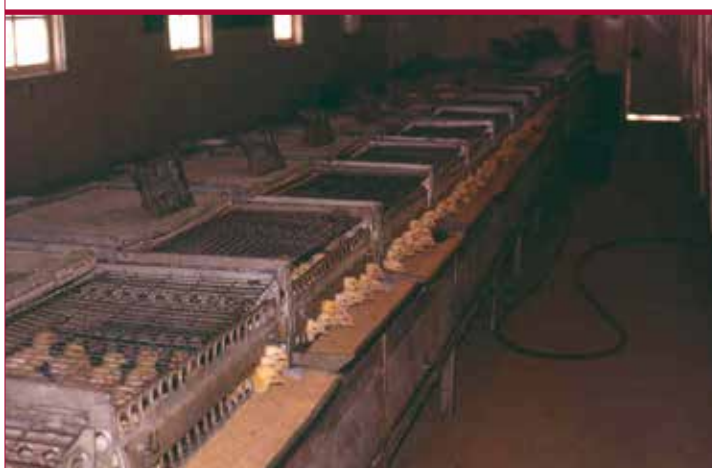
Older style brooding cages for layer chicks: hot water pipes run along and above the brooder section at the back of the cages; an oil- or gas-fired heater heats the water

For village chicks, drinkers can comprise bamboo sections or water bottles. These should be cleaned and refilled daily. Feed and