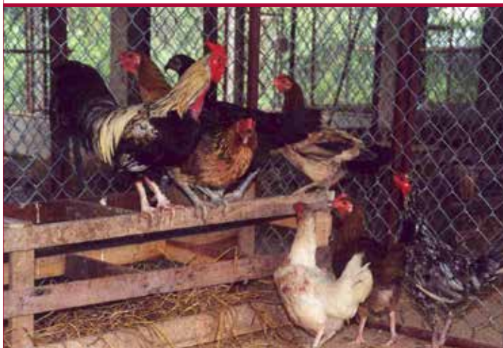
Small-scale breeding programme with indigenous breeds

Chicks that are reared for use in a breeding programme should be kept separate from other birds in other age groups. Cockerels should also be grown separately from females, preferably until five months of age. Generally, however, this approach is not possible in village operations. Most chick rearing in hot-climate developing countries is carried out in naturally ventilated houses. In commercial operations, chicks scratch in the litter, creating uneven litter levels, particularly around feeders and drinkers. Small