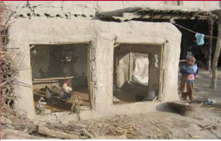
Improved chicken housing (Afghanistan)

to identify suitable locally available ingredients and diets that provide the nutrients required by chicks and hens at this stage.