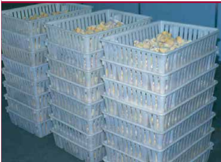
Day-old chicks in 100-bird chick boxes following hatch

cal sexing, where the chick's cloaca is everted and the vestigial copulatory organ can be seen in male chicks. Both of these procedures require extensive training. The second approach involves fixing appropriate sex-linked feathering rate or colour genes in the parental lines (see website on Poultry genetics and breeding in developing countries). In the progeny from such matings, male chicks are either slow-feathering or white, and hatchery staff can readily distinguish them at hatch from their rapid-feathering or coloured-feathered female counterparts.