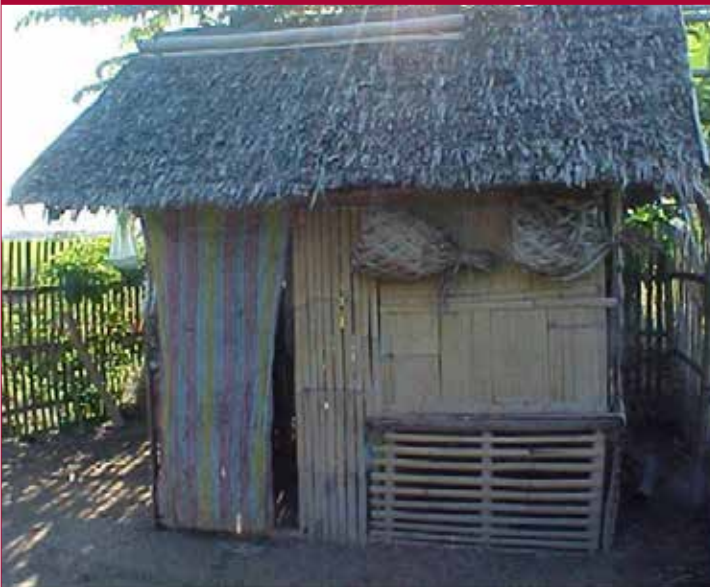
House with woven banana-leaf nests for chickens under the eaves (Philippines)