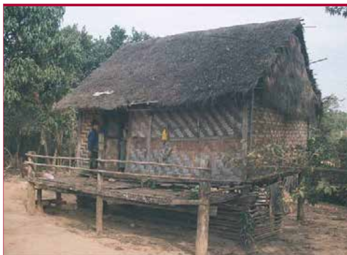
Household flock of scavenging chickens provided with night-time shelter under the human dwelling (Myanmar)

Small (five to 30-bird) family-owned flocks, usually of indigenous breed or crossbred birds, are given household food scraps and sometimes small amounts of grain or grain by-products, and spend much of their time during daylight hours scavenging around the house and yard for seeds, insects, snails, earthworms, grass, shoots, fallen fruit, frogs, etc., depending on the local environment and season. Household scraps and supplementary grain typically comprise a significant proportion of the energy intake of these birds, particularly in the dry season (see website on Poultry feed availability and nutrition in developing countries). Birds are not usually provided with water, so have to obtain it from the environment. This can have a marked impact on their health and productivity, particularly in the dry season.