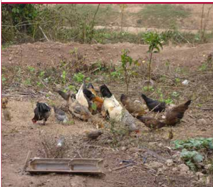
Semi-scavenging poultry production (Lao PDR)

Indigenous breed birds are seldom reared or housed in confinement, as their productivity (egg and meat production), even under good-quality ad libitum feeding, is insufficient to warrant the cost of this level of management. Confinement rearing may be justified for some higher-producing indigenous strains or cross-breeds, where there is a niche market for their eggs or meat. Conversely, improved breed/strain commercial birds cannot perform at their genetic potential under semi-scavenging management conditions, so are not suitable for this form of production. The survival of commercial genotypes (particularly broilers) is severely compromised under scavenging systems.