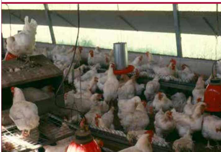
Broiler breeder hens and cocks in a deep-litter naturally ventilated house