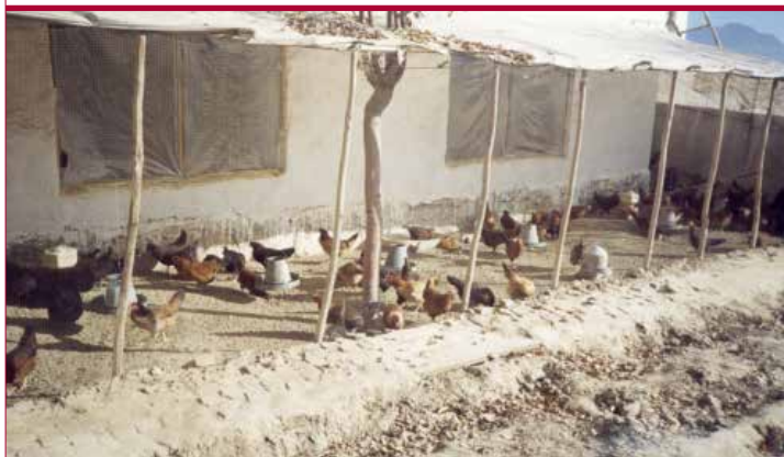
Semi-intensive sector 3 type layer production (Afghanistan)