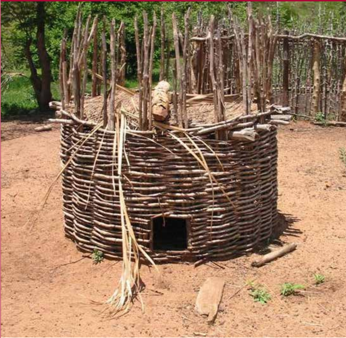
Poultry house for overnight shelter (Mozambique)