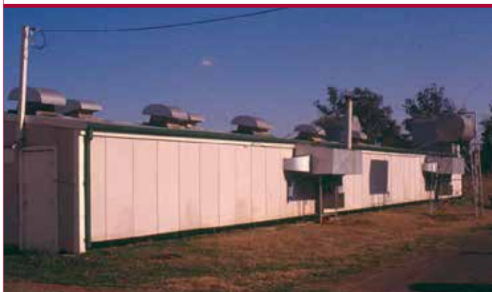
Oil or gas-fired hot air brooder units on side of shed for whole-house brooding: the entire brooding area is heated to the required temperature