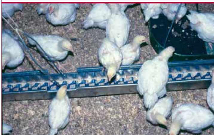
Trough and chain automated system of feeding broilers