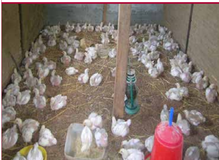
Sector 3 small-scale broiler house (Bhutan)