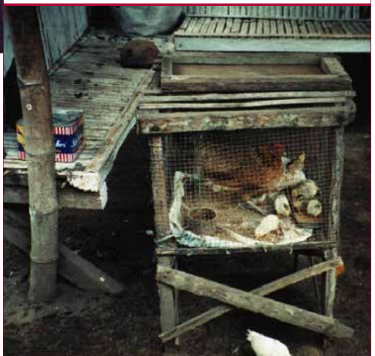
Hen and young chicks kept in cages for the first two weeks post-hatch (Philippines)

One of the major constraints to improving productivity in many regions is the limited availability of suitable prepared feed or feed ingredients for hens and young chicks in the first week or two following hatch. In these regions, considerable efforts are needed