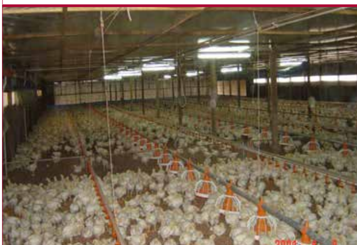
Sector 1 large-scale broiler operations