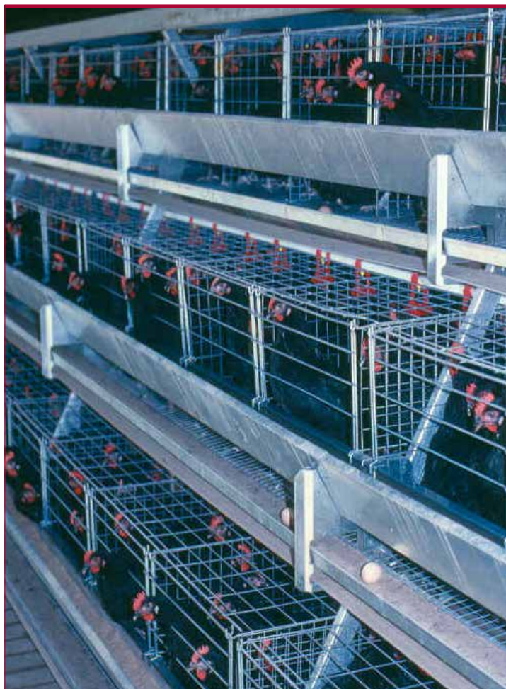
Modern tier-step layer cages: the cages have automated watering, feeding and egg collection

Egg size is largely genetically determined, but can be manipulated by lighting and feeding programmes. The larger the body weight at maturity, the larger the hen's eggs will be for her entire life. Egg weight is thus generally a reasonable indicator of body weight, but in general the earlier a flock begins production, the smaller the egg size will be, and the later the onset of egg production, the larger the egg size. Lighting programmes can be manipulated to influence rate of maturity (Bell and Weaver, 2001). A decreasing light pattern continuing past ten weeks of age delays maturity and increases average egg size. Egg size is greatly affected by the intake of energy, total fat, crude protein, methionine and cystine