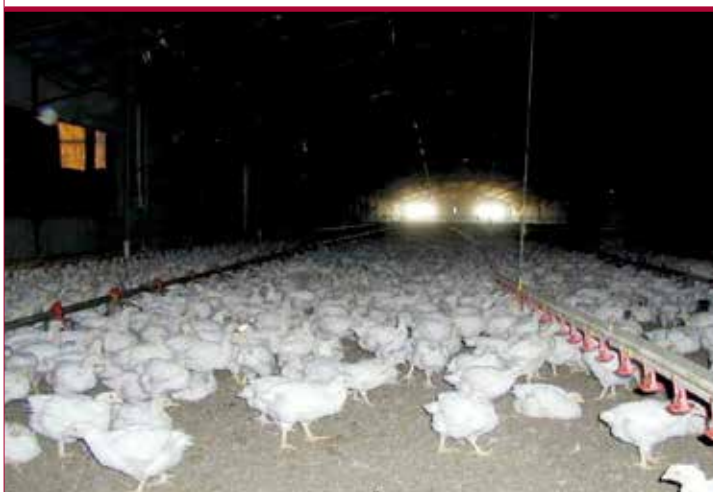
Tunnel-ventilated broiler house: exterior and interior views