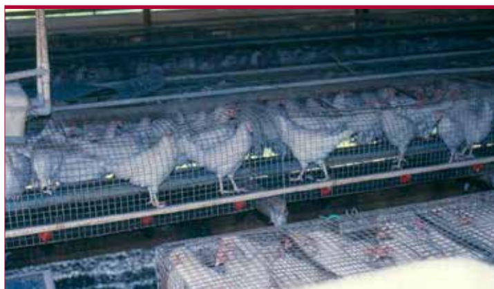
Rearing layer pullets in multiple-bird wire cages

Birds also need to adapt to the presence of humans, and walking through a poultry house regularly will socialize them. In the laying period, the lighting times need to be synchronized with those in the rearing facility. When birds are placed in the laying house they need to be encouraged to explore the nest boxes. Commercial-scale operations can do this with nest lights to train the birds to use the nests.