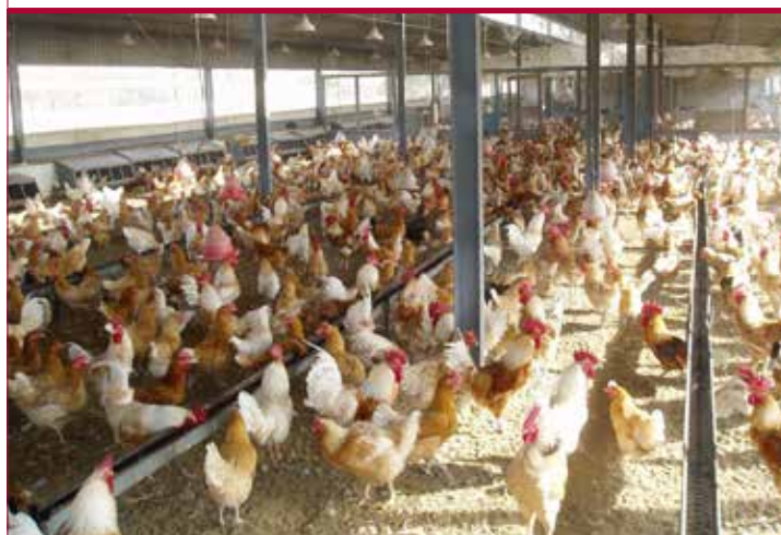
Large-scale modern layer barn (above) and sector 2 layer production unit (Egypt, below)