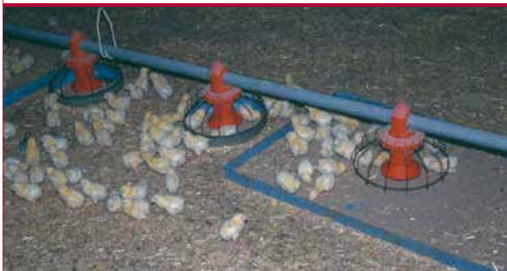
Conveyor and pan automated feeding system for young chicks: for the first five days post-hatch every third pan in the line is replaced with scratch trays

water should be within 1.5 m of all chicks. In large flocks, automatic drinkers are typically used. These can be nipple, cup or bell waterers.