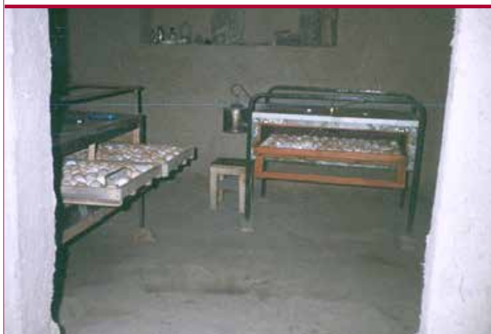
Kerosene operated incubator in small hatchery