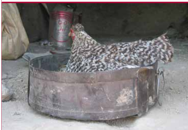
Hatching by a broody hen

In large-scale operations in developing countries, incubator setting capacity ranges from approximately 10 000 to 100 000 eggs. The equipment used to incubate and hatch chicks is all precisely controlled (Cobb-Vantress, 2008). Optimum temperatures for setters are 37.1 to 38.6 °C, at a relative humidity of 60 to 70 percent. The hatching eggs are set vertically, with the blunt end uppermost in the setter, and are turned mechanically through 90° every hour