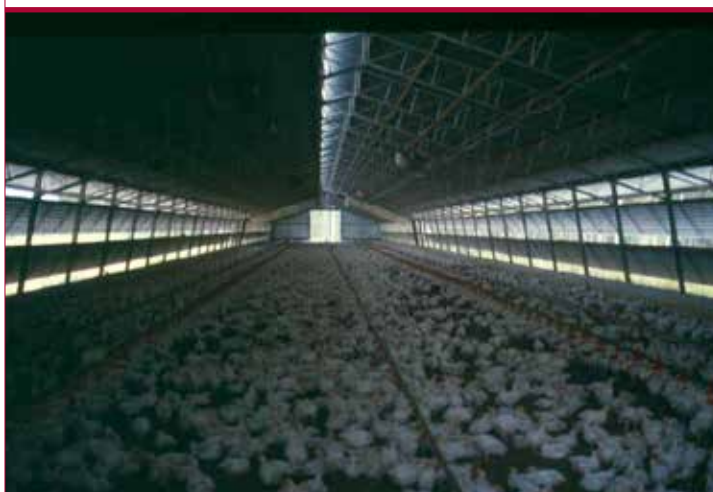
Large-scale naturally ventilated broiler house

If feeder space is insufficient, growth rates will be reduced and uniformity will be compromised. Feed distribution and the proximity of the feeder to the birds are essential for achieving optimum feed consumption rates. In tropical developing countries, the main factor reducing feed consumption is high temperatures. Feed should be withheld at the hottest time of the day, to prevent heat stress and the resultant mortality. Pan feeders are better than