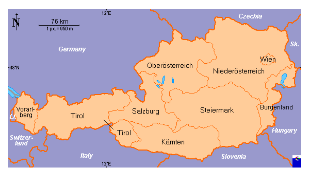
Fig. 1. Map of Austria with the nine provinces indicated.

Land-use patterns in Austria change from Alpine to non-Alpine regions. Approximately onetenth of Austria is bare or unproductive land, normally found above the tree line. Forty-six percent of Austria is covered by forests, the majority of which is in Alpine regions. Less than one-fifth of Austria is arable and suitable for conventional agriculture. The percentage of arable land in Austria increases in the East as the country becomes less mountainous. More than one-fifth of Austria is pasture and meadow located at varying altitudes. Almost half of this grassland consists of high Alpine pastures. Because of the Alps, the country as a whole is one of the least densely populated states of Western and Central Europe (93 inhabitants/ km<sup>2</sup>).