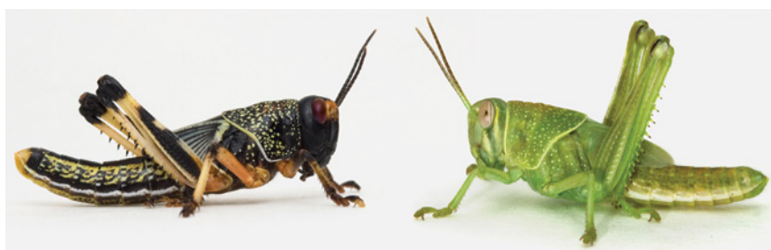
Colour differences between swarming (black and orange) and solitary (green) desert locust

The largest Desert Locust outbreak in recent years occurred in West and Northwest Africa, between October 2003 and May 2005, affecting 24 countries. Some 13 million hectares were sprayed with 13 million litres of pesticides and huge amounts of food aid were mobilized. Harvest losses were valued at up to US$2.5 billion, with a disastrous effect on food security. In Mauritania, one of the countries affected, 80 percent of heads of household went into debt because of the locust problem – either crops were eaten, or their agribusinesses were destroyed.