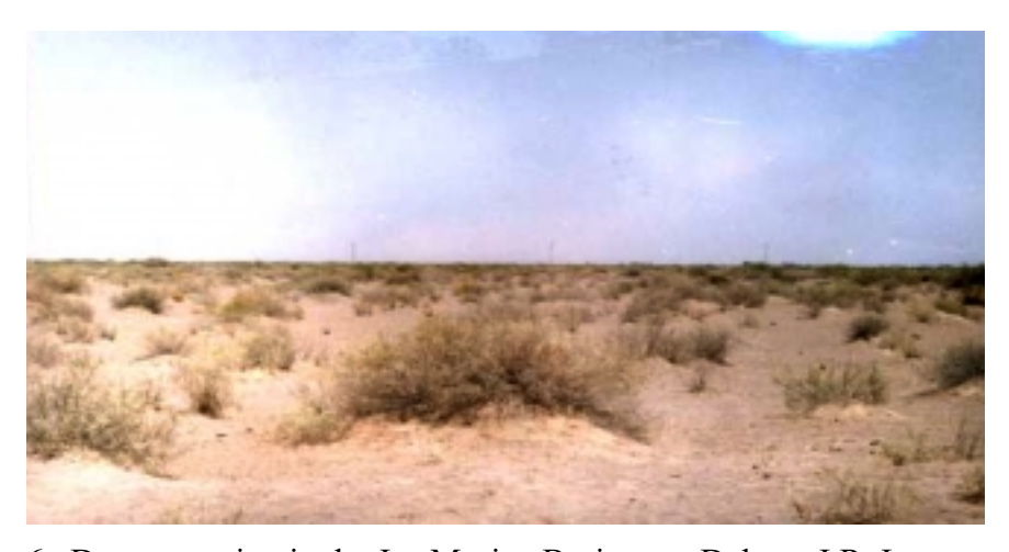
6. Dry vegetation in the Jaz Murian Basin near Dalgan, I.R. Iran.