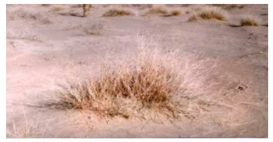
2. Dry vegetation in the desert of Shamsabad near Bampur, I.R. Iran.