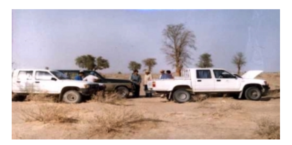
5. Resting in the desert of Solan , I.R. Iran after over heating of vehicles.