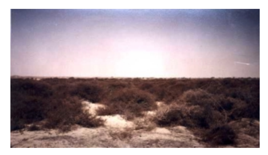
8. A view of dense vegetation (dried) in Kulanch area near Pasni, Pakistan.