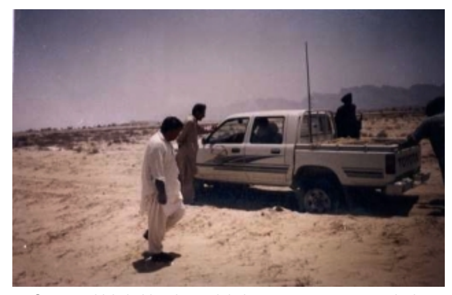
7. Survey vehicle held up in sand during cross country survey in the Shooli area near Turbat, Pakistan.