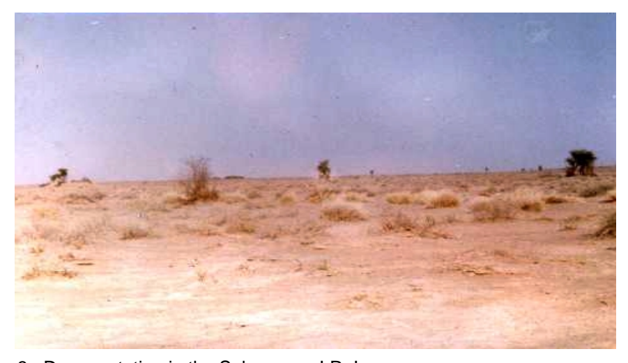
3. Dry vegetation in the Solan area, I.R. Iran.