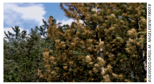
Damage caused by Ips sexdentatus: L, pitch tubes; R, discoloured needles of Austrian pine (Pinus nigra), France