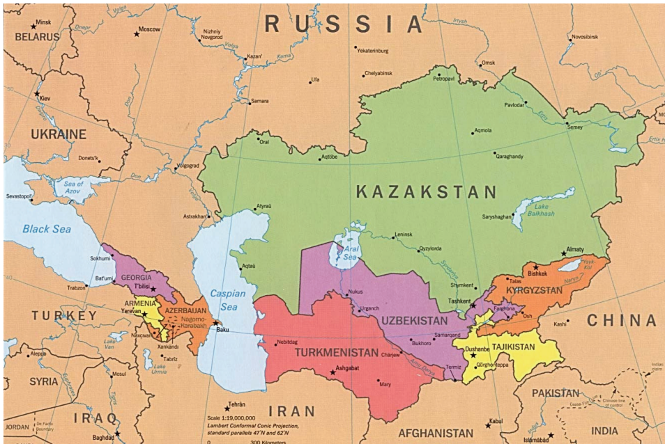
Figure 1. Map of Central Asia

At the Regional Workshop in Antalya, it was agreed that there was a need to facilitate follow-up work on the formulation of country-specific policies, strategies and action plans for the promotion of CA. As a guide to this follow-up work, a regional strategic framework for CA in the Central Asia region has been included as an Annex to be used as a ‘road map’ (Annex II).