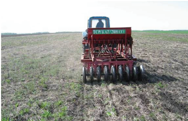
Figure 3. No-till planting under rainfed conditions in Northern Kazakhstan

This section is based on the outcomes of the study on status of CA and country reports presented by CIMMYT (Kazakhstan) (Karabayev et al., 2012), ICARDA (Azerbaijan and Uzbekistan), Irfan Gultekin (Turkey), FAO-SEC (Kyrgyzstan and Tajikistan) and in Nurbekov et al. (2013). The review information presented in Nurbekov et al. (2013) on the status of CA in Kazakhstan, Uzbekistan, Tajikistan, Kyrgyzstan and Turkmenistan has also been used for this section.. The review by Kienzler et al. (2012) of CA in these five countries also provides useful information on the state of the knowledge base on CA in the Central Asia region. Overall, evidence illustrates a favourable impact of CA, but the evidence base needs to be improved, calling for more adaptive research, taking into account the different agricultural environments and socio-economic conditions. Adoption and spread of CA practices would need increased information dissemination, awareness, and learning among farmers and policymakers about the benefits of CA.