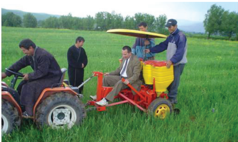
Figure 5. Testing no-till drill in Tajikistan

Of the seven Central Asia countries, only Kazakhstan, Uzbekistan and Azerbaijan have farmland under CA, but all the countries are keen to promote the transformation of their agriculture from tillage-based systems to CA. In Turkey, research on no-till system including with raised beds has been carried out over the past two decades with favourable results in different parts of the country, and there are locally manufactured direct seeders, but there does not seem to be any systematic effort directed towards the dissemination of CA (Gultekin, 2012). It appears that in Tajikistan (Muminjanov and Sanginov, 2012) and Kyrgyzstan, some elements of CA can be found within several donor funded projects implemented in the past. However, their geographic coverage and number of beneficiaries (mostly farmers) are relatively small.