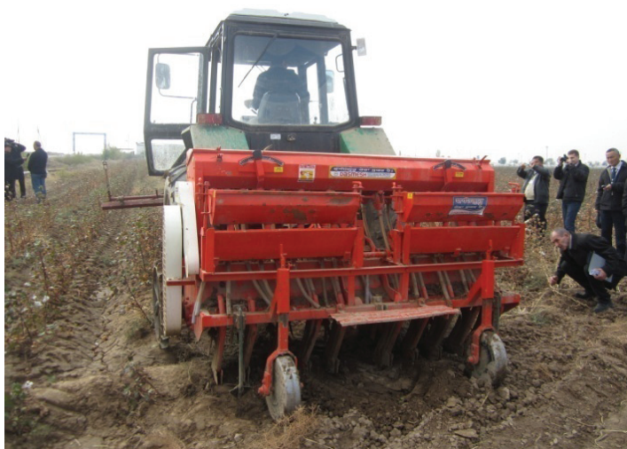
Figure 10. Planting no-till wheat on permanent beds after cotton

Numerous experiments with locally made and imported seeders have been conducted and seeders have been tested for the common raised-bed systems as well as flat seeding. In irrigated cotton-wheat systems, the replacement of moldboard plowing with conservation tillage reduced cotton yield, but not of wheat (Suleimenov et al., 2004). Hence a modified system was suggested: the use of the moldboard plow for cotton and the use of conservation tillage for wheat. Prior to introducing CA practices, seeding equipment was adapted in Uzbekistan (Tursunov, 2005; Egamberdiev, 2007). As a first step, seedbed preparation and planting/seeding was tested in North-western Uzbekistan (Tursunov, 2009, cited in Nurbekov et al., 2013). The modifications in an imported Indian no-till seeder included the introduction of a seeding-depth regulator, appropriate soil openers for planting into the hard and mulched soil, the seeding blade that now is suitable for various crops, and an adoption of the row distance regulator. The modified seeder became suitable for planting cotton and wheat on permanent beds (Tursunov, 2009).