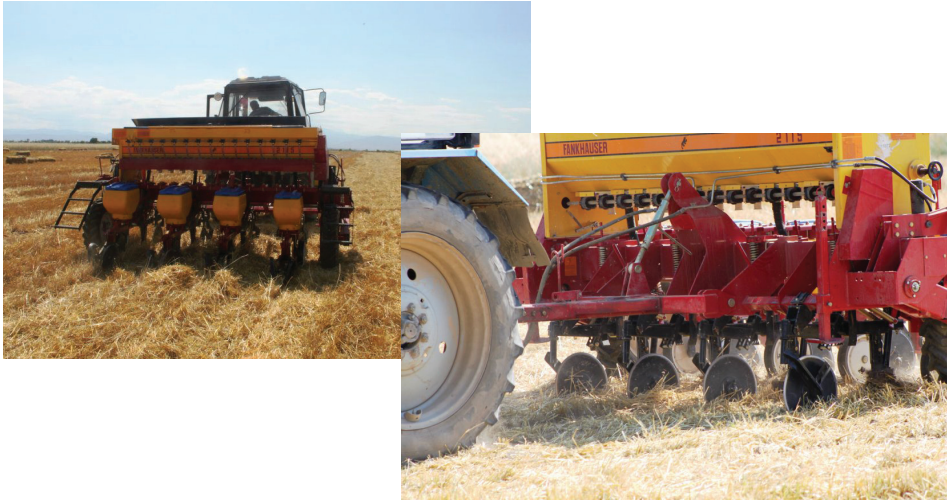
Figure 4. No-till planting under irrigation in Azerbaijan

Of the seven Central Asia countries, only Kazakhstan, Uzbekistan and Azerbaijan have farmland under CA, but all the countries are keen to promote the transformation of their agriculture from tillage-based systems to CA. In Turkey, research on no-till system including with raised beds has been carried out over the past two decades with favourable results in different parts of the country, and there are locally manufactured direct seeders, but there does not seem to be any systematic effort directed towards the dissemination of CA (Gultekin, 2012). It appears that in Tajikistan (Muminjanov and Sanginov, 2012) and Kyrgyzstan, some elements of CA can be found within several donor funded projects implemented in the past. However, their geographic coverage and number of beneficiaries (mostly farmers) are relatively small.