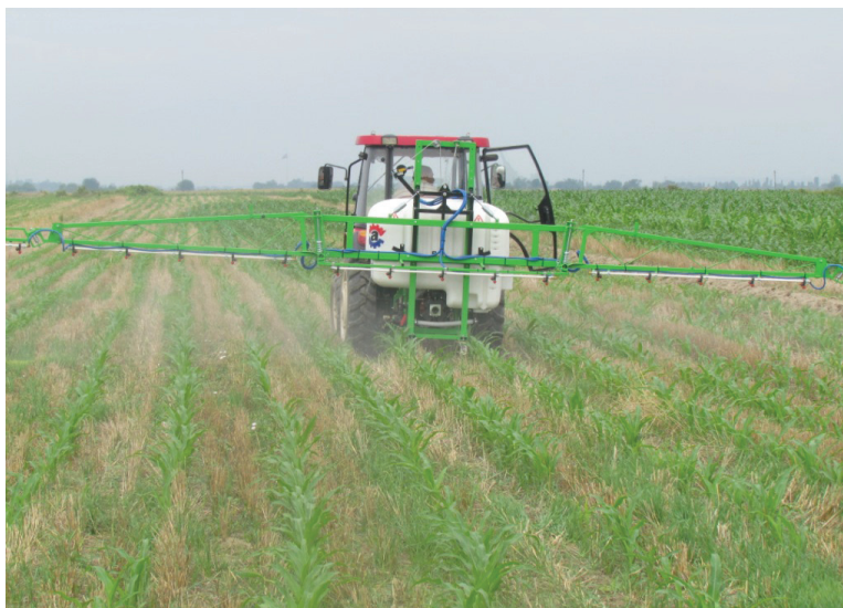
Figure 9. Spraying herbicides to manage weeds

Operation of no-till seed drills requires the knowledge of the variety of the openers and coulters and their effects on the groove shape and seed placement. Groove shape and seed placement play important role in seed germination under moist soil conditions. To master such skills, the operator must have deeper knowledge of different soil types whereas in conventional tillage system field preparations for sowing are uniform in terms of the use of machinery. Depending on the surface residue levels, the operator should be able to select the appropriate coulters types and make necessary adjustments to seed the no-till crop.