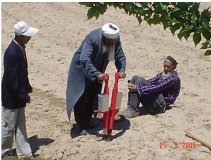
Figure 8. Adoption and promotion of CA requires proper tools such as jab planter

In Turkey, there has been considerable research done on no-till and CA systems with results generally similar to those obtained in Azerbaijan and Kyrgyzstan but there has not been a serious attempt to promote the dissemination and adoption of CA. This is beginning to change and projects are being formulated and implemented that aim at the introduction and adoption of CA. Turkey already manufactures no-till direct seeders that are exported to countries within the region and beyond.