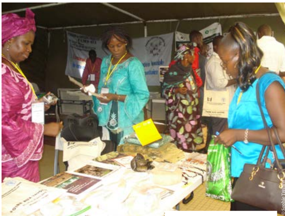
The knowledge share fair in Niamey.

The good practices and the experiences documented took many different forms. First and foremost, the goal of capitalization is to improve the quality of work, share experiences, adopt new practices and scale them up. The information documented has been adapted to different target audiences and has used various communication channels. As well as written documents, such as case studies,