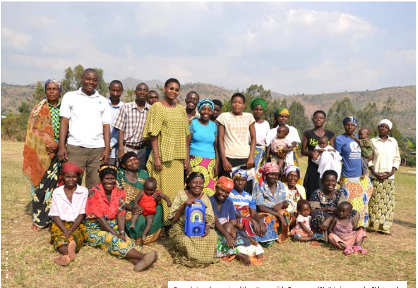
Group photo at the occasion of the setting up of the Twungurane (“Let’s help one another”) listeners’ club, in Ramba Zone, Kabezi Municipality (Bujumbura rural Province).