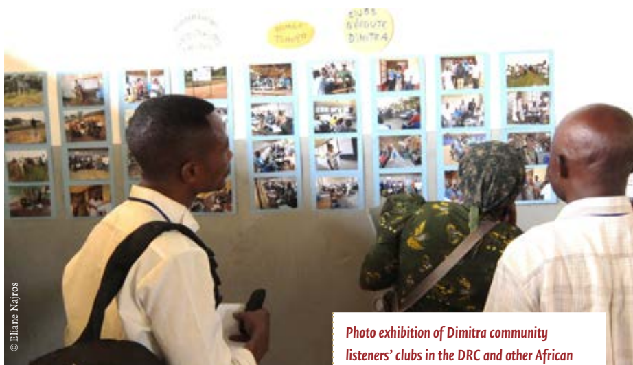
Photo exhibition of Dimitra community listeners' clubs in the DRC and other African countries organized during the Forum.