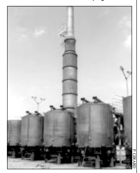
Metal kilns equipped with vapour incinerators (shown here in France) can help reduce environmental pressure by increasing charcoal yields, but they tend to be unaffordable in developing countries

energy" market opportunities under development. Therefore forest services and energy agencies should give particular attention to charcoal and its sustainable production and use. Effective actions might include, among others: