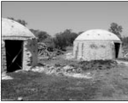
Improved traditional charcoal production: a Brazilian-type brick kiln in Cuba