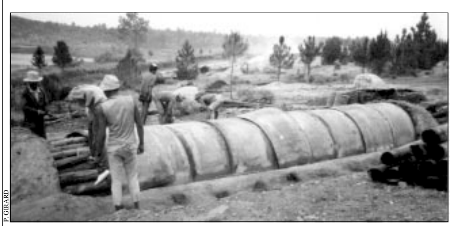
A semi-permanent low-cost "Subrifosse" type metal kiln in Madagascar was designed to carbonize offcuts from sawmilling