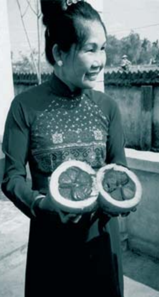
Gac fruit ( Momordica cochinchinensis Spreng.) in Viet Nam

not always be possible, depending on the extent of food availability, distance, fragility of the food items, and whether or not a market for the food has been developed – indeed, if such development is even wanted by the rural community. It is well known that indigenous peoples often live according to value systems that may conflict with a more dominant global value system based on economic returns. An investigation of the factors affecting indigenous urban migrant access to traditional foods would be well worth pursuing.