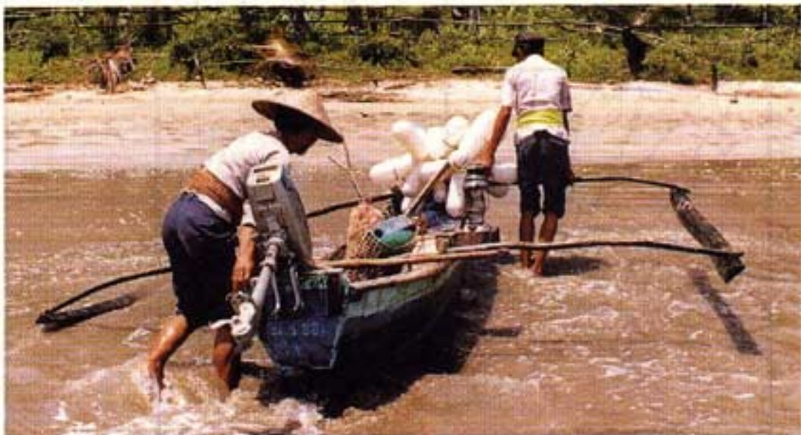
Outrigger dugout 4-5 m. with outboard motor.