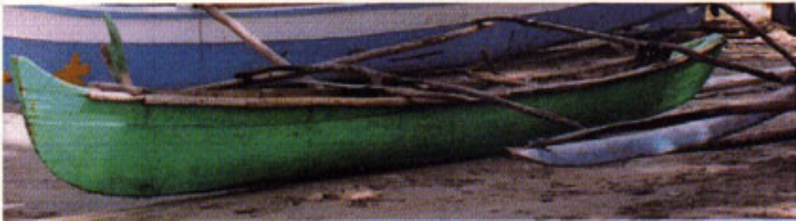
Non-motorised outrigger dugout 4-5 m.

The double-outrigger canoe of 4-5 m in length is the only type of fishing craft used in the traditional fishery. The main hull is a dugout; sail and paddles are used for propulsion. There are about 2100 of these canoes, of which about 70 had been motorized with 2-8 hp outboard motors at the time the project got underway.