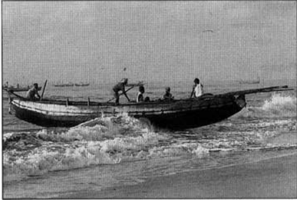
A traditional nava coming in to beach on the Andhra Pradesh coast.