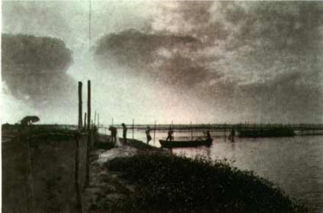
The shrimp pens at Killai – an overview (above)