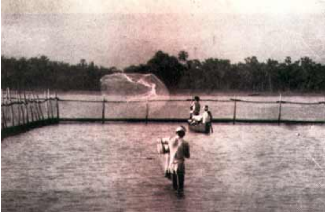
Harvesting of cultured shrimp by castnet.