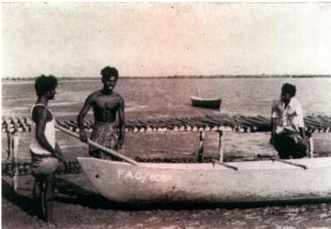
The fishermen-cum-pen culturists with their transport boat, a canoe.