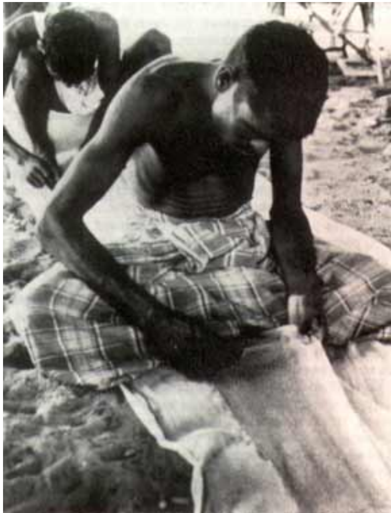
Stitching of nets for the pen wall (above) and mending of nets (alongside).