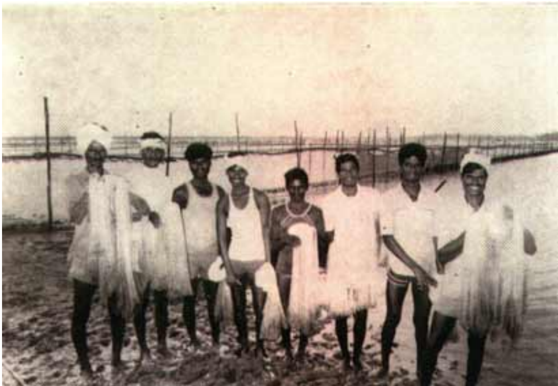
The eight fishermen selected to operate 16 pens, each of .25 ha area.