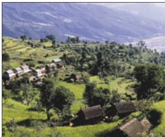
Cultivating trees in combination with crops and livestock is an ancient practice, but interest in agroforestry has been rising since the 1970s, with socio-economic aspects now gaining attention

farmers whose cattle formerly grazed on annual grasses and legumes (Abadi et al. , 2003).