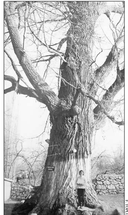
Individual selected for ex situ conservation, Kütahya, Aegean region