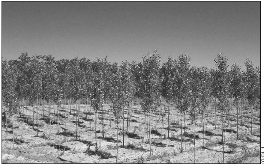
Black poplar field clone trial, Ankara, Central Anatolia

In some parts of central, eastern and southeastern Turkey, black poplar is cultivated in field, roadside and riparian plantations using traditional methods. Where land is reserved for agriculture, row plantations can protect arable land and produce wood for local needs. In the main river basins, about 100 000 km of waterways are suitable for gallery plantations, i.e. one to three rows of poplars planted on both sides of the waterway (Semizoglu, 1979); some gallery plantation projects are under way supervised by the Ministry of Forestry.