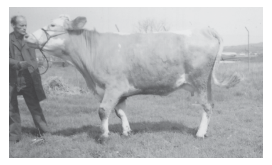
Figure 2. Simmental cow.

BCSS = Body condition score, within one week after service (1-5).