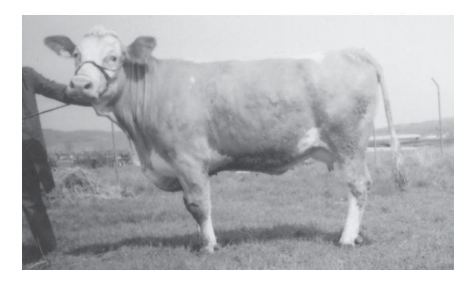
Figure 1. A Simmental cow.