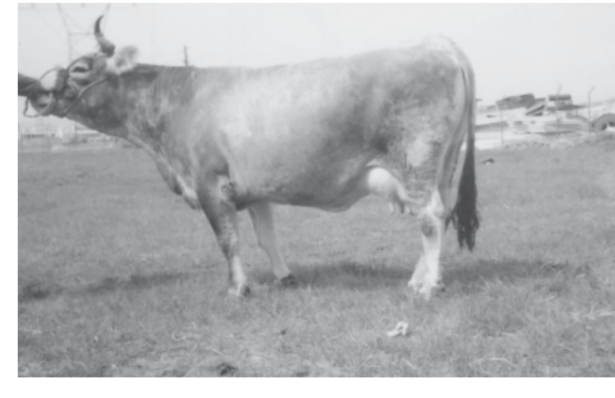
Figure 5. Tyrol Grey cow.

For birth weight of calves and their growth rates until 3 or 10 months of age, breed differences as well as least-squares mean of breed differences were significant