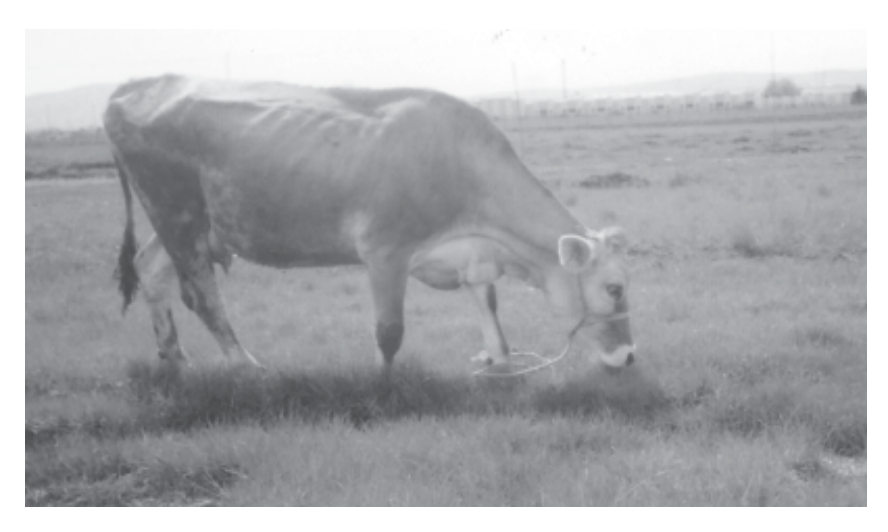
Figure 3. Brown Swiss cow.