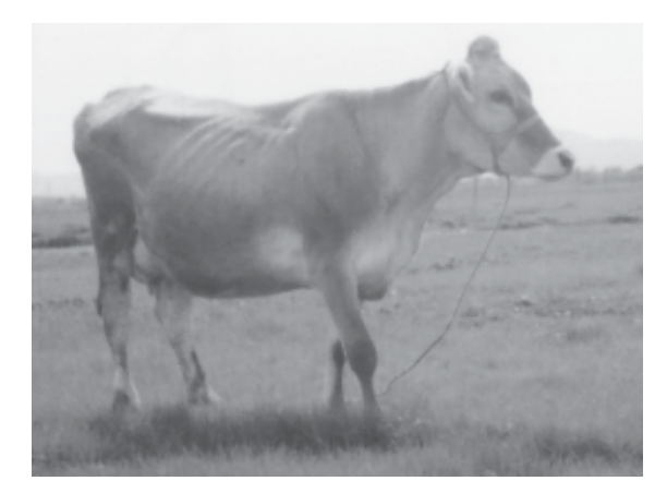
Figure 4. Brown Swiss cow.

Several socio-economic indicators were recorded;