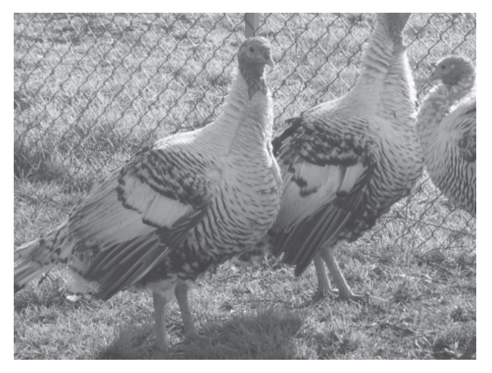
Figure 8. Ermellinato di Rovigo turkey