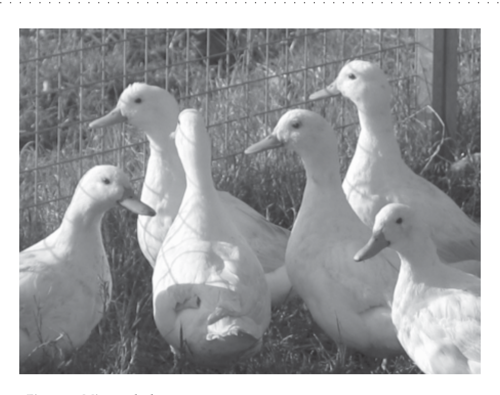
Figure 7. Mignon duck.

very rustic. Egg production by the Mignon breed is not very important (50 to 70 eggs per year), but this light duck is used for meat production.