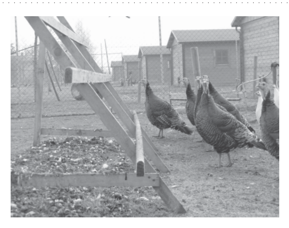
Figure 9. Comune Bronzato turkey.