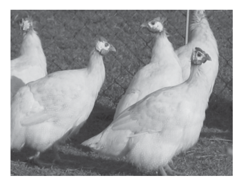
Figure 10. Camosciata guinea fowl.