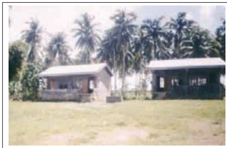
Photo 3. School building used as an evacuation centre in Balud.

Most farmers have small huts in higher areas that they can move to when the residential area is flooded. An elevated school building, built in 2002 a few meters away from the barangay hall, serves as an evacuation centre (Photo 2).