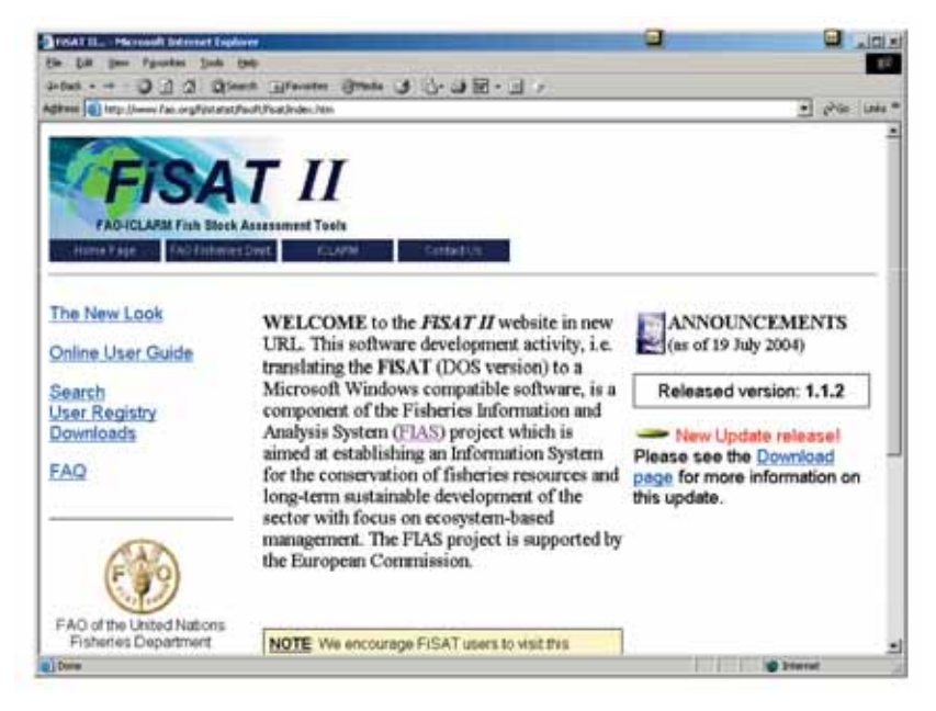
Fig. 2.2. FiSAT II home page. The content of the pages varies as the need arises. The current URL is http://www.fao.org/fi/statist/fisoft/fisat/index.html.

A FiSAT II website is maintained by FAO to provide a venue for distributing updates to the software and other announcements related to the application of the software (Fig. 2.2).