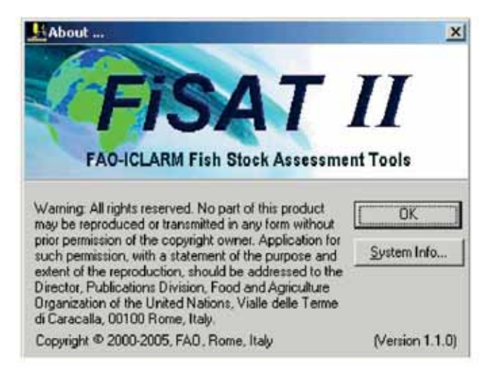
Fig. 2.3. The "About FiSAT II" form. The system information may also be accessed from this form.

The FAO technical staff will provide a step-by-step procedure on what needs to be retrieved and mailed to resolve a technical problem. Please refer to Microsoft Windows reference manuals for details on the use of the interface that displays system information.