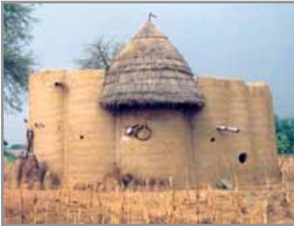
PHOTO 1. Tamberma castle

forests, now gradually receding, grow along the rivers (Jeune Afrique Editions, 1981).