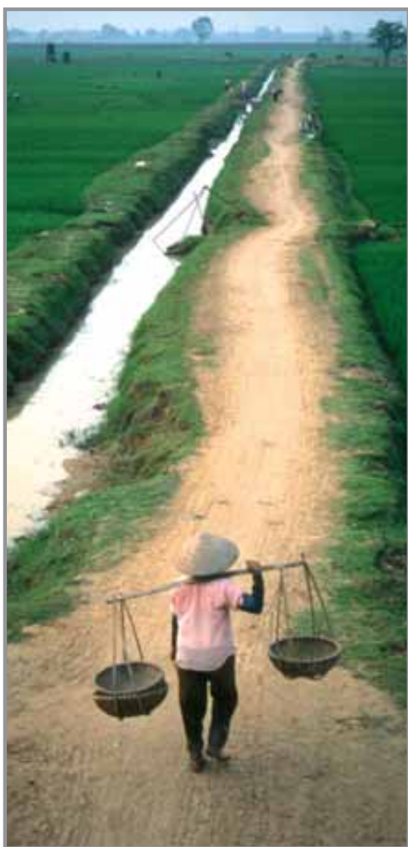
PHOTO 7. As the sun is rising, a duck-rice farmer walks to his rice field

There are two main hatching methods; one uses artificial means and the other uses an apparatus. The artificial method is relatively rare: in the south, eggs are heated by other eggs, while in the north, warm rice or oil lamps are used to brood eggs. This technology is neither efficient nor hygienic and often results in broken eggs and low hatching. Home-made incubators with capacities from 8 000 to 14 000 eggs are used in all three provinces; these are easy to manage and improve hatching efficiency.