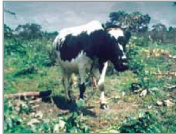
PHOTO 2. Somba cattle breed