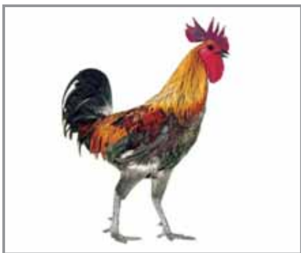
PHOTO 4. Black Bone Rooster

Egg production is 55 to 78 eggs per hen annually. Hens lay during five distinct periods per year, during which they produce 11 to 14 eggs. Egg weights range from 35 to 40 g. Chickens begin laying at 30 weeks, at a body weight of 1.2 kg. Hens of indigenous breeds take