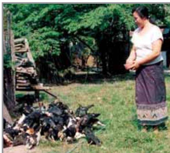
PHOTO 1. Indigenous chickens in their natural habitat

Lowland farming systems. In the Mekong corridor, farmers grow rice in the rainy season; irrigation, allows a second crop; 90 000 ha (or 15 percent) of the rice is irrigated. Livestock and crops are complementary: