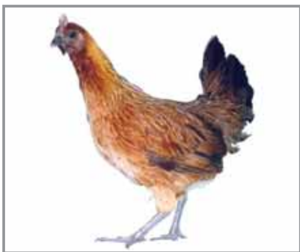
PHOTO 5. Black Bone Hen