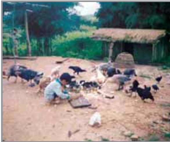
PHOTO 12. Backyard chicken farming

inhalation. Women and children give feed and look for nests. Men make chicken pens and select cocks for fighting.