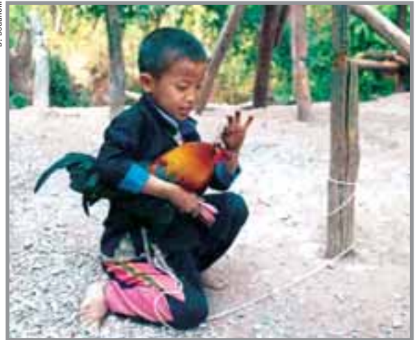
PHOTO 13. Child playing with indigenous fighting cock

The Department of Livestock and Fisheries, at national,