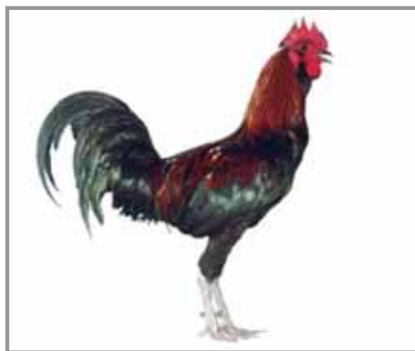
PHOTO 2. Kai Ou Rooster

Kai Horn Chou chickens are widely distributed and are phenotypically very similar to Kai Chae, but distinguished by a greater body size and a pea comb. Cocks weigh 1.3 to 1.7 kg, hens between 1.2 and 1.5 kg. Hens produce 70 eggs per year on average and have a hatching capacity of about 75 percent.