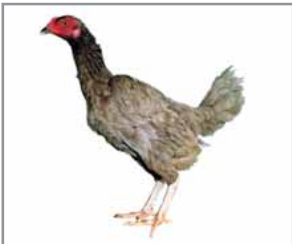
PHOTO 9. Kai Yolk Hen