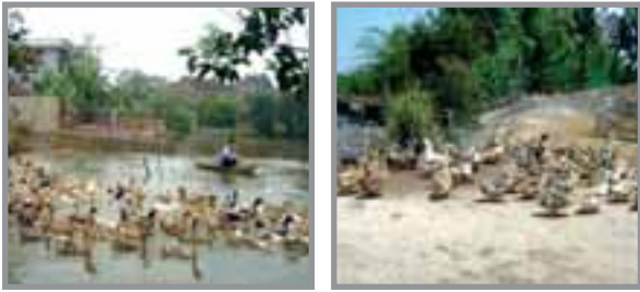
PHOTO 5 and 6. During daytime Co ducks roam around freely scavenging for worms, insects etc.