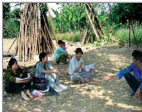
PHOTO 3. Surveying duck farmers