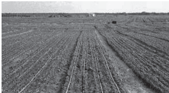
FIGURE 2.3 - Modern irrigation techniques.

The design complexity and the multiplicity of costly equipment is only apparent. The technology of piped irrigation systems is simple and flexible, and the investment yields a good return. Several mechanical difficulties are to be expected in the early stages. Subsequently, the farmers become familiar with the system's features and components and make the best use of it. The application of piped irrigation techniques produces a drastic change in irrigation management practices at farm level.