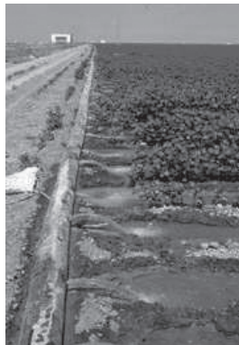
FIGURE 2.2 - Improved surface irrigation method with pipes.

These component parts replace the ones in the traditional surface systems, i.e. the main gate, the main and submain canals, the canal gates the field ditches, and the furrows or the basins, respectively (Figure 2.2).