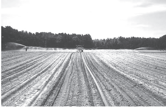
FIGURE 9.6 - Spray Boom in operation.