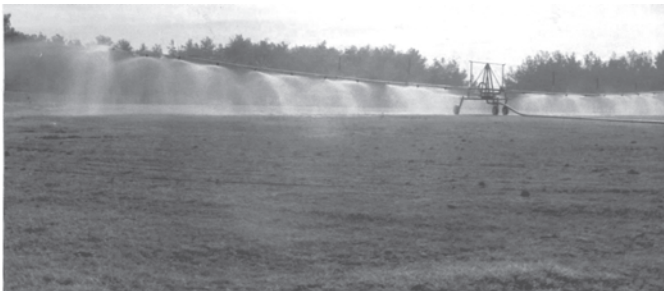
FIGURE 9.7 - Spray Boom machine.