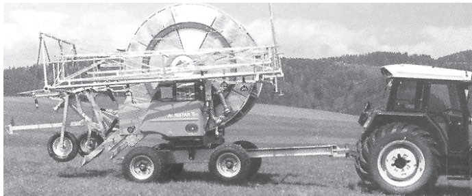
FIGURE 9.5 - Towing the compact machine.

The area should be a plain agricultural field of regular shape. The system can be towed and moved to a next position nearby and so on (Figure 9.5). The Spray booms can operate on uneven ground, however, level lands are recommended and uniform sloping fields with slopes up to 1 percent. Undulating topography may produce a lot of difficulties especially where runoffs occur.