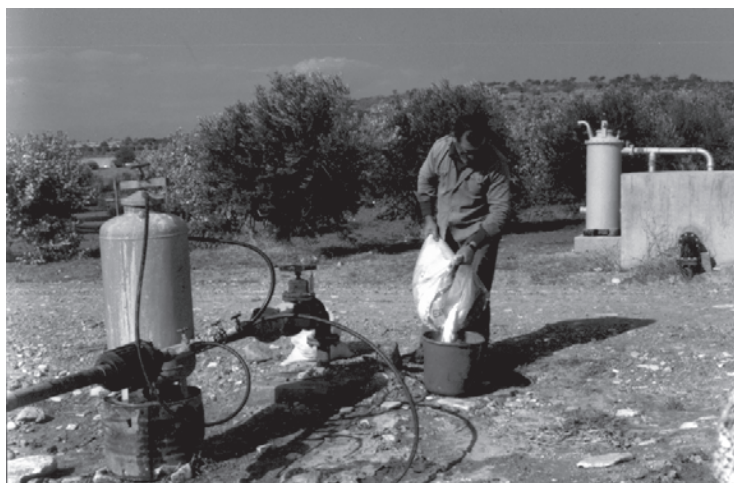
FIGURE 16.2 - Preparing the fertilizer solution.

The above recipes are recommended for irrigation water with very low salinity. As a rule of thumb for average quality water, the maximum fertilizer concentration, which is added to the irrigation total salinity, should have an EC of about 0.5 dS/m. For higher concentrations, the salinity level in the soil root zone must be checked frequently and the application adjusted according to the soil test results.