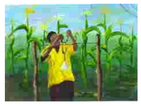
A farmer hanging a bell on rope

Hang alarm bells on fence round your farms to warn you of the presence of elephants. The noise from bells can also drive elephants away