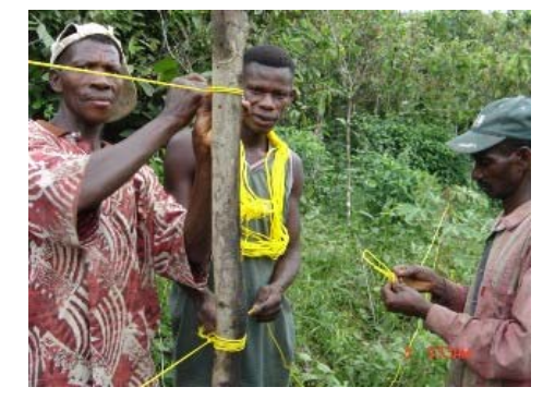
A group of farmers preparing a fence

Hang alarm bells on fence round your farms to warn you of the presence of elephants. The noise from bells can also drive elephants away