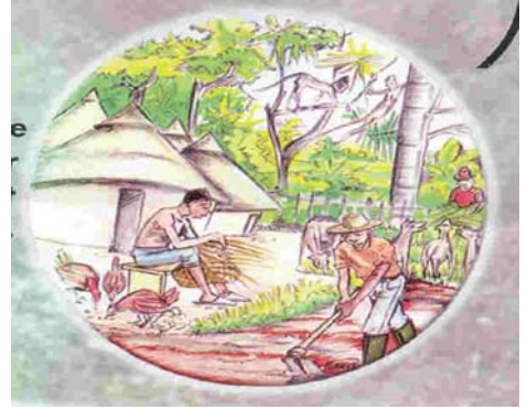
Settlements close to a forest reserve

Avoid settling close to forest reserve boundaries.