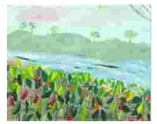
A young chili pepper farm

Avoid growing crops eaten by elephants. Grow crops that are not eaten by elephants, such as pepper ginger and cotton and which can give you good returns if you have to grow crops near to a forest reserve boundary.