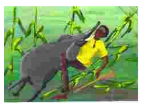
A hunter attacked by an elephant

Avoid shooting to kill elephants. A wounded elephant may attack and hurt or even kill you.