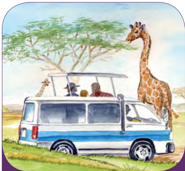
Wildlife attract tourism