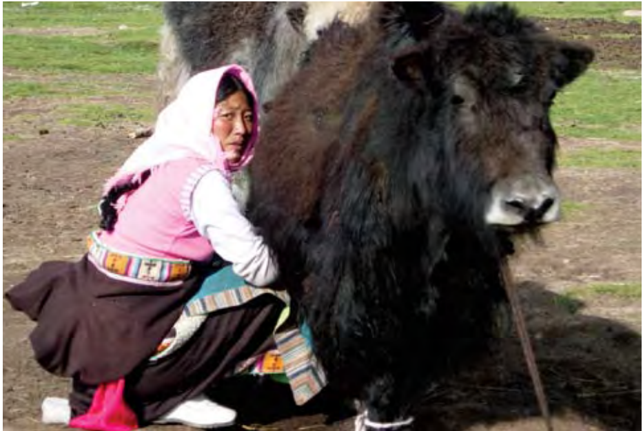
The yak is important to the livelihoods of the inhabitants of the Tibetan plateau in China

Most breeding programmes aimed at improving the productivity of indigenous chickens have used cross-breeding. This approach has provided significantly higher productivity, but has resulted in a loss or dilution of the indigenous birds' morphological characters and instinct for broodiness. For example, the Sonali breed, developed in Bangladesh as a high-yielding breed for use in under semi-scavenging conditions, lost popularity among smallholders when they discovered that they had no success in reproducing it. Similarly in India, when villagers received cross-bred hens from a research institute, they expressed concerns about the dilution of morphological characters (Besbes, 2008).