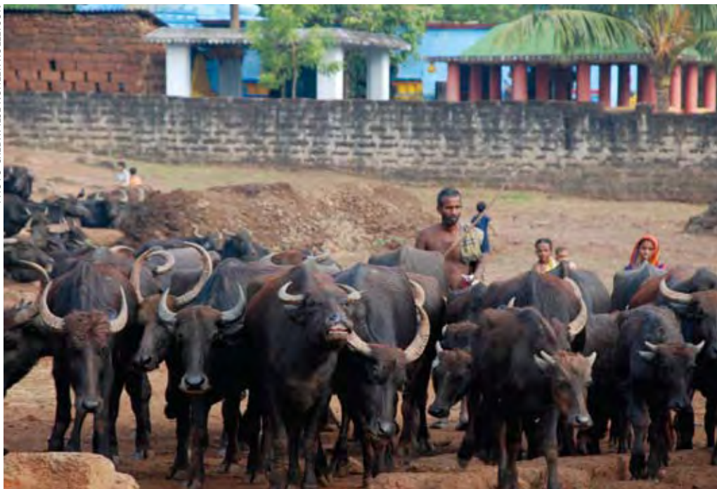
The Chilika buffalo is important for people's livelihoods and as part of the Chilika lake ecosystem in Orissa, India