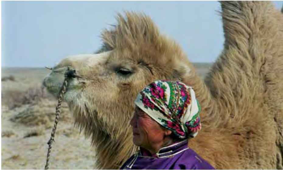
The Bactrian camels of the Gobi desert in Mongolia provide wool, transport, milk and meat

“feeding competence”, defined as the ability to select the best season-specific browse or graze, and the ability to negotiate difficult terrain. The capacity to browse includes the ability to reach, choose, ingest and process the highly nutritious forage that their herders lead them to. The WoDaaBe also select their animals for “social competence”, in order to minimize stress in interactions within the herd and with the herder (Krätli, 2008).