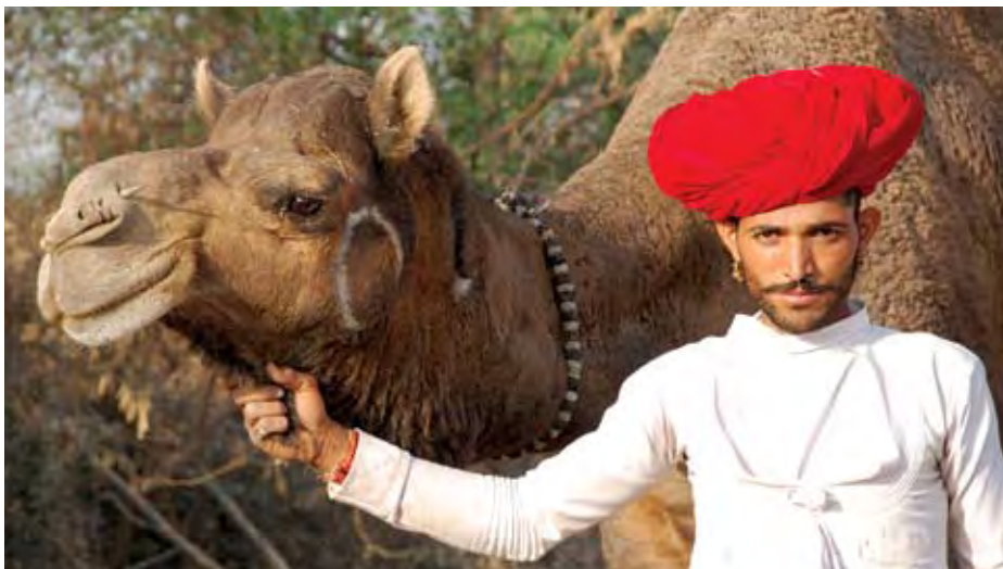
The Raika pastoralists are the custodians of the dromedary in Rajasthan, India