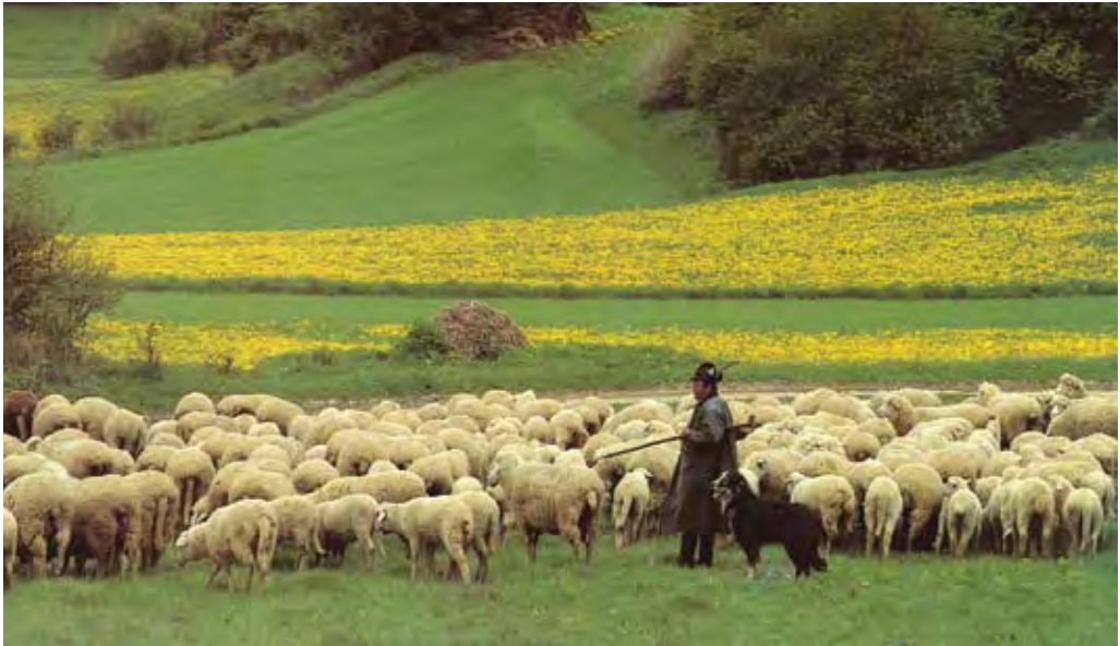
Sheep flocks have become important for landscape and biodiversity conservation in Germany