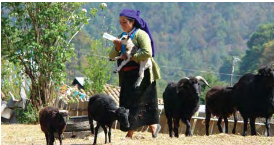
Tzotzil sheperdesses in Mexico breed and take care of their black sheep breed