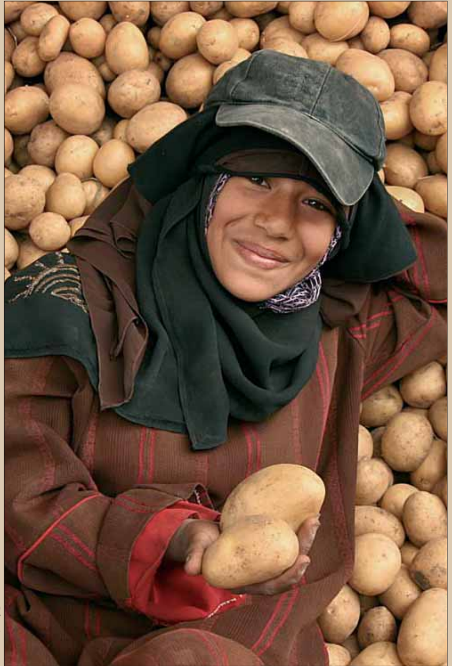
AT A POTATO SORTING FACTORY IN THE NILE DELTA, EGYPT.