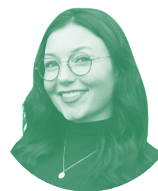
Co-moderated by Dana Collins