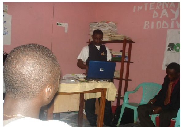
Climate Change Effects Kwakwa

Deforestation and poverty remains on the rise because no action is taking on the ground meanwhile a lot of resources is spent world-wide especially on meetings.