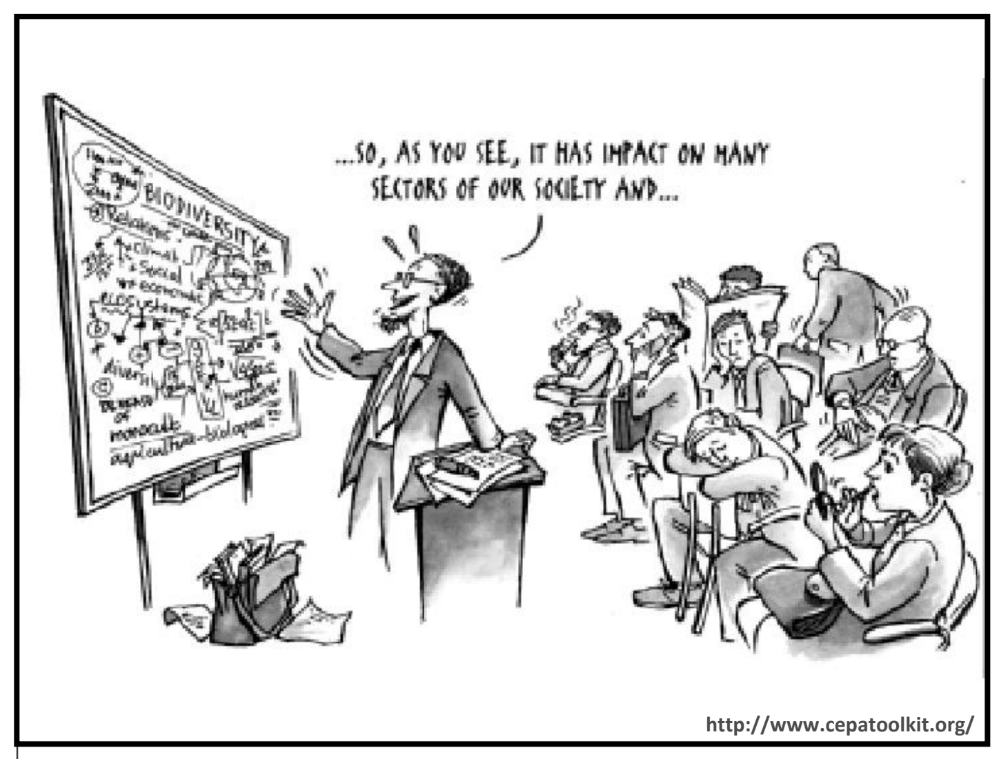
Empowering public participation?