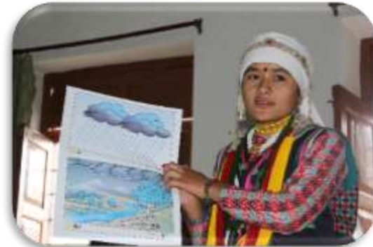
Climate Proofing Value chains