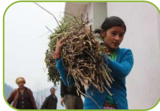
Invasive species-impact analysis and management