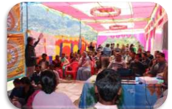
Management planning for ecosystem services