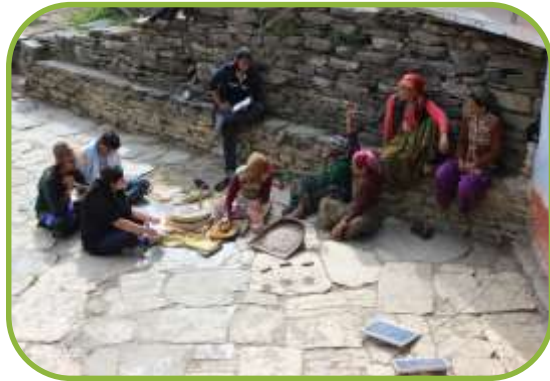
Participatory Natural Resource Management