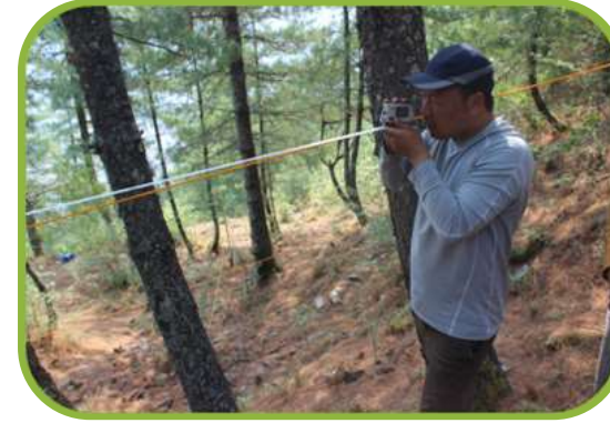
Long term socio-ecological monitoring