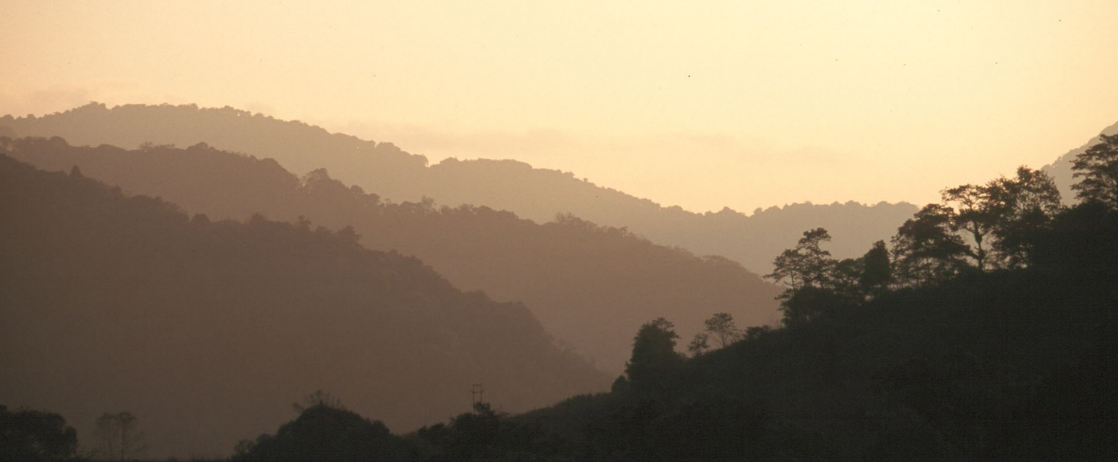
PLATE 1: The Naga Hills, in Northeast India, take on a golden hue as the sun begins to set.