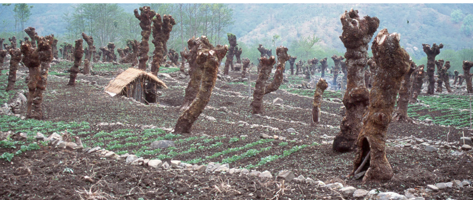
PLATE 3: In Nagaland, Khonoma village's system of managing alder trees in its jhum fields is a prime example of the type of farmer innovation that this volume hopes to document.