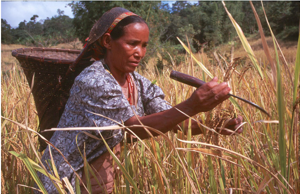
PLATE 4: An Angami shifting cultivator deftly harvests her swidden rice and deposits it in the basket on her back.

With your collective wide experience in this field, I suspect that there must be some really interesting shots amongst your personal photo archives, and we'd love to include a few of them in this next volume! I emphasize that we are extremely careful in making sure that the contributing photographer is properly accredited! If any of your photos are selected for publication, then we will get back to you later to seek your help in developing an appropriate caption to accompany it.